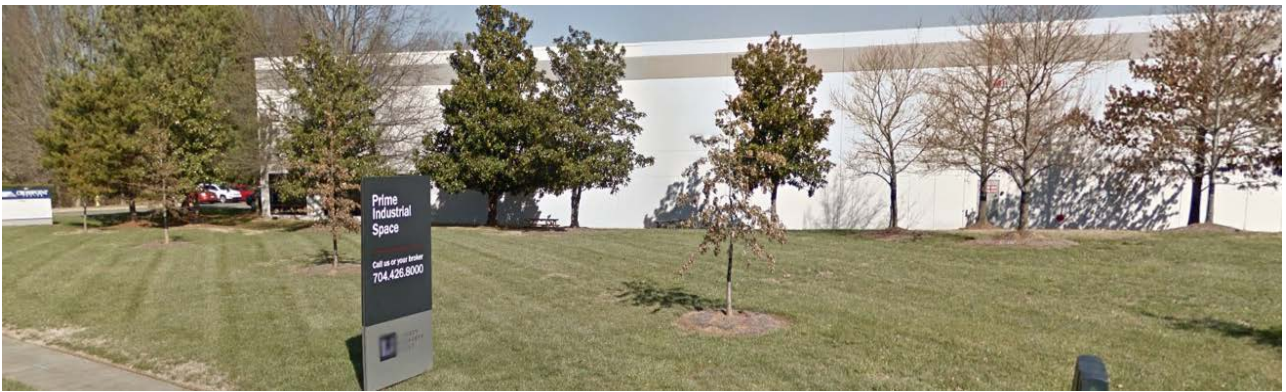
Properties to the south, across Cindy Lane, are developed with industrial uses.