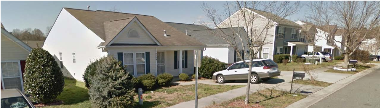
Single family homes surround most of the site.