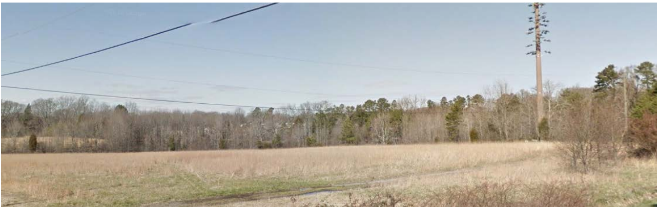
The subject property is mostly vacant land with an existing single family home (shown below) and a cell tower.