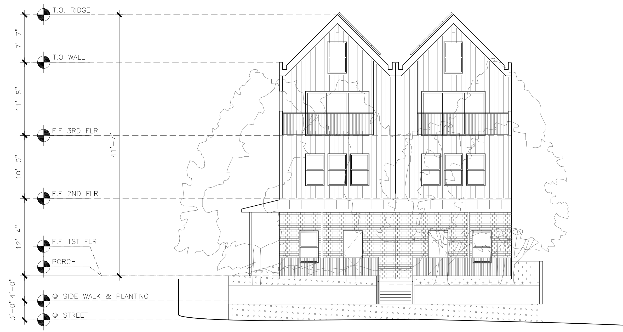
ELEVATION @ NORTH DAVIDSON STREET