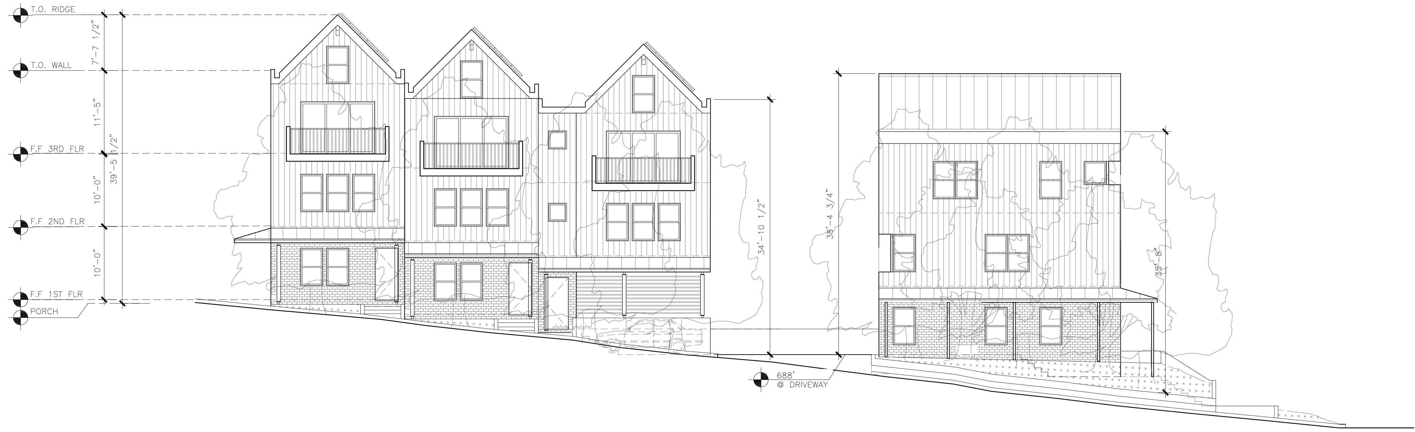
ELEVATION @ EAST 17TH STREET