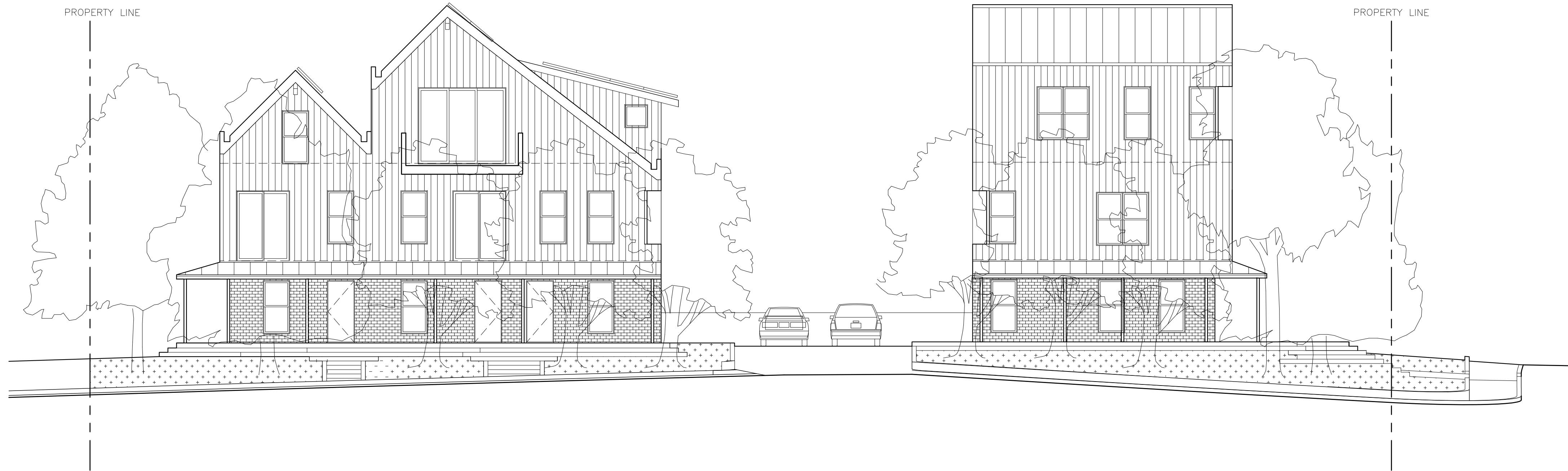
ELEVATION @ NORTH MCDOWELL STREET