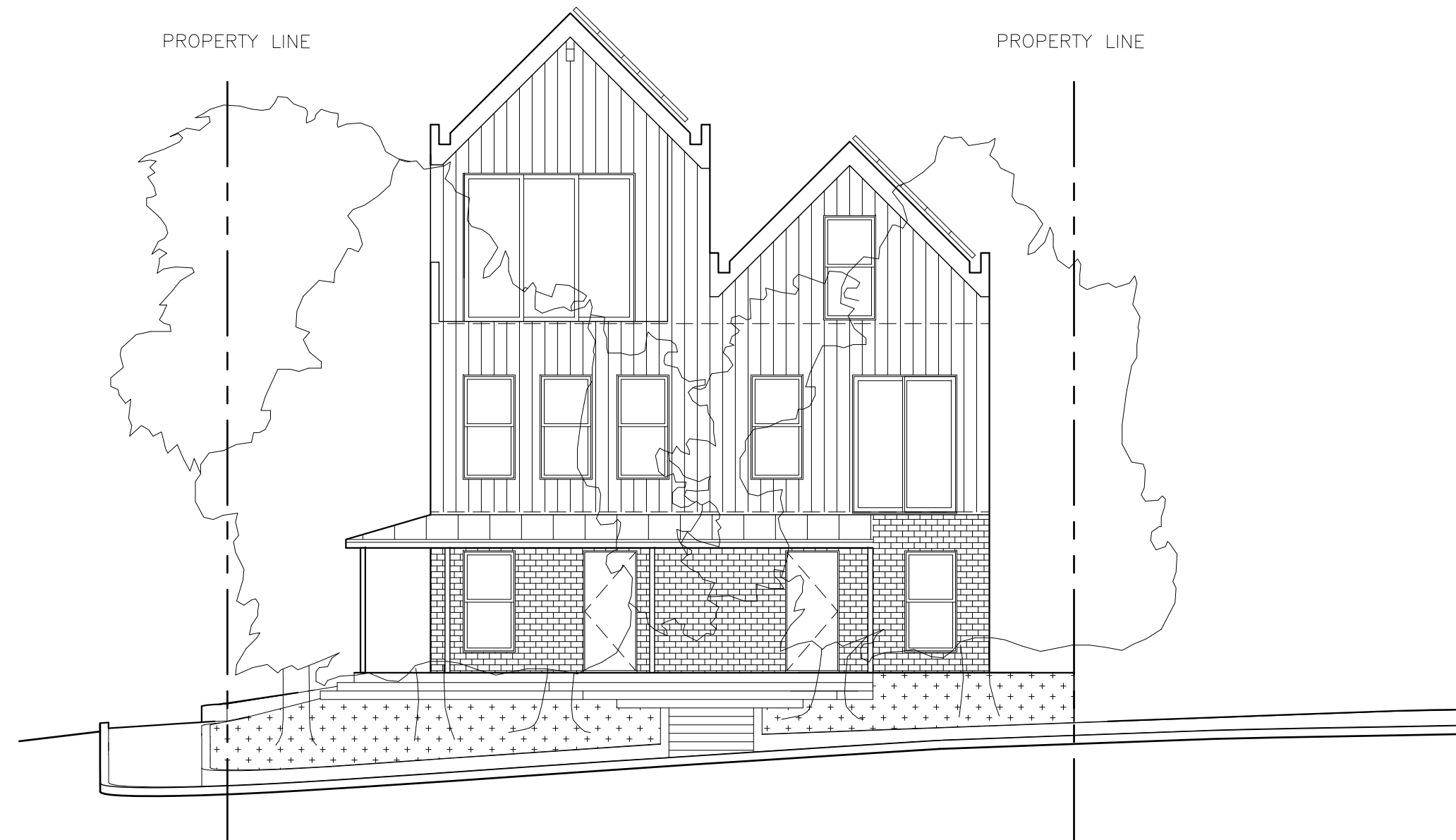
ELEVATION @ EAST 17TH STREET