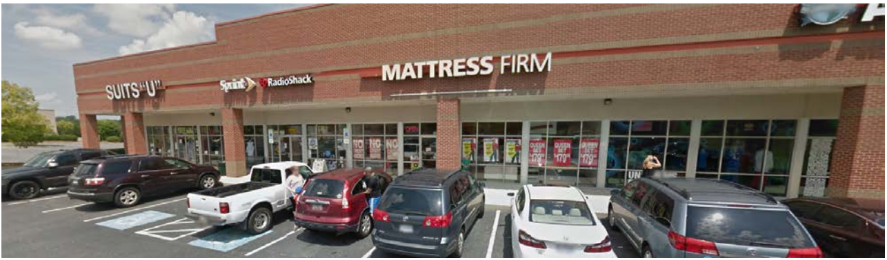
The subject property is zoned CC (commercial center) and developed with a retail strip shop use.