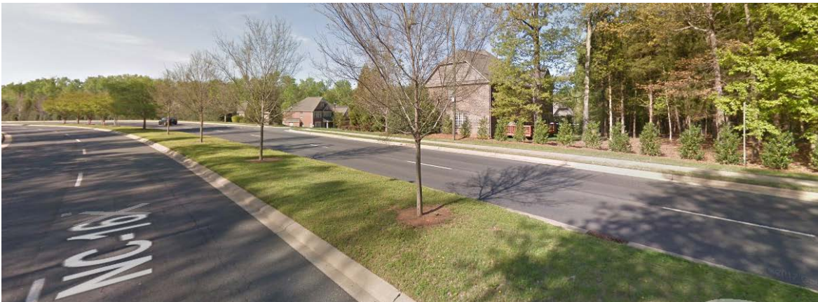
Approximately 250 feet southwest of the site and across Provide Road from Providence Presbyterian Church, on the west side of Providence Road are single family homes. This is closest single family neighborhood to the site.