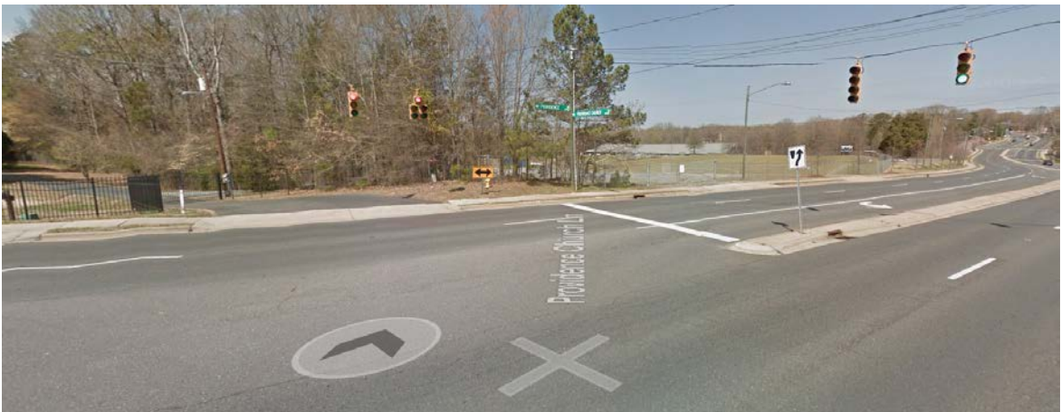
North of the site on the west side of Providence Road is Charlotte Latin School.