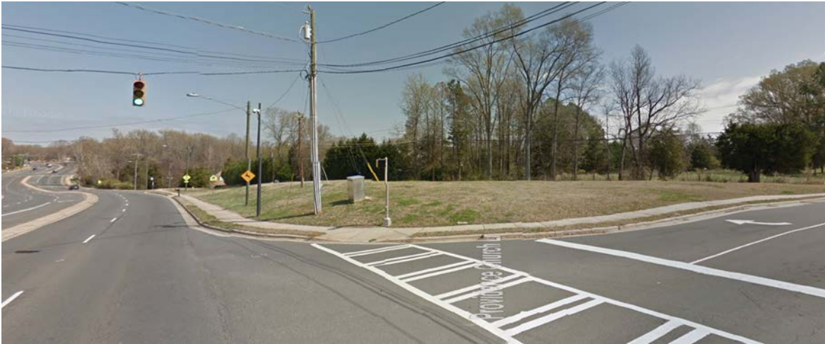
Approximately 280 feet northeast, across from Charlotte Latin School Campus and across Providence Church Lane from the site, is the next closest single family neighborhood.