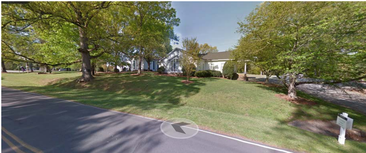
South of the site between Providence Road and Providence Church Lane is Providence Presbyterian Church.