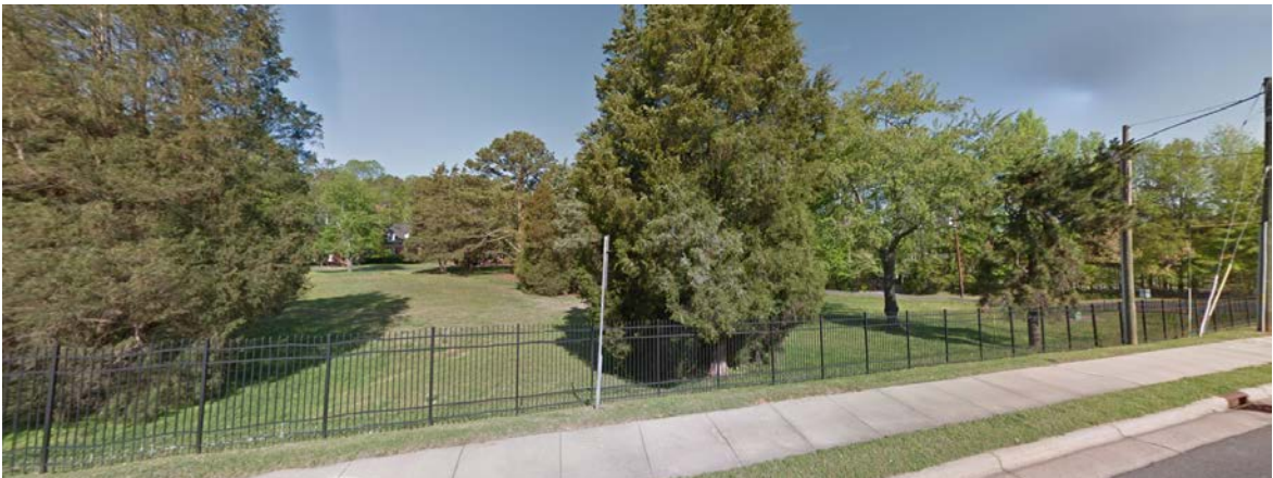
West of the site, across Providence Road is a single family home that is part of the Charlotte Latin campus.