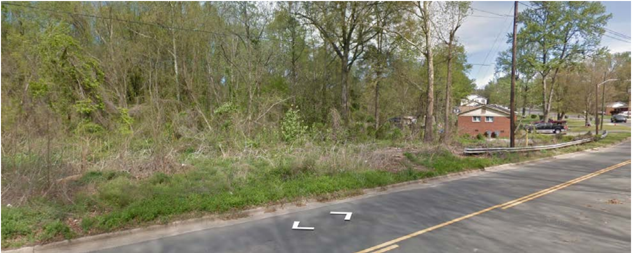
Subject property is vacant with single family residential homes to the east, along West Craighead Road.