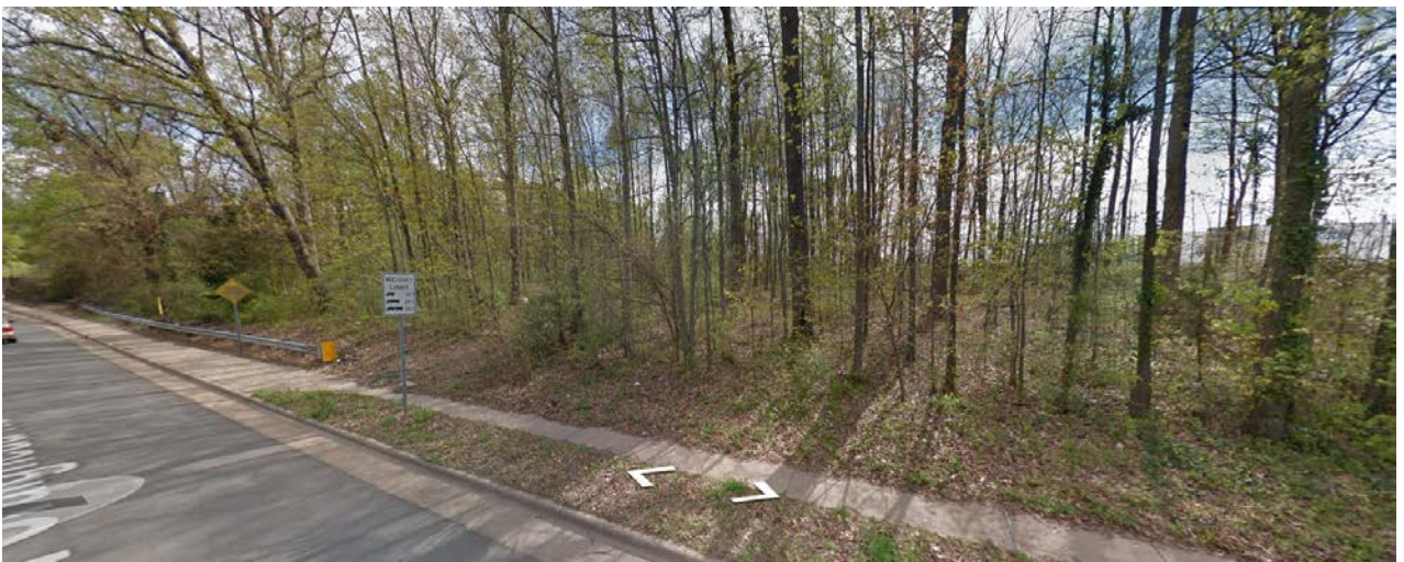
South of the site, across Craighead Road is property owned by Mecklenburg County for Derita Creek Community Park.