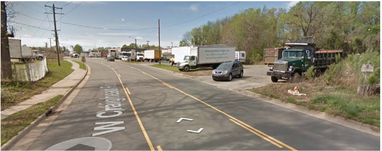
Industrial uses front Craighead Road west of the site.