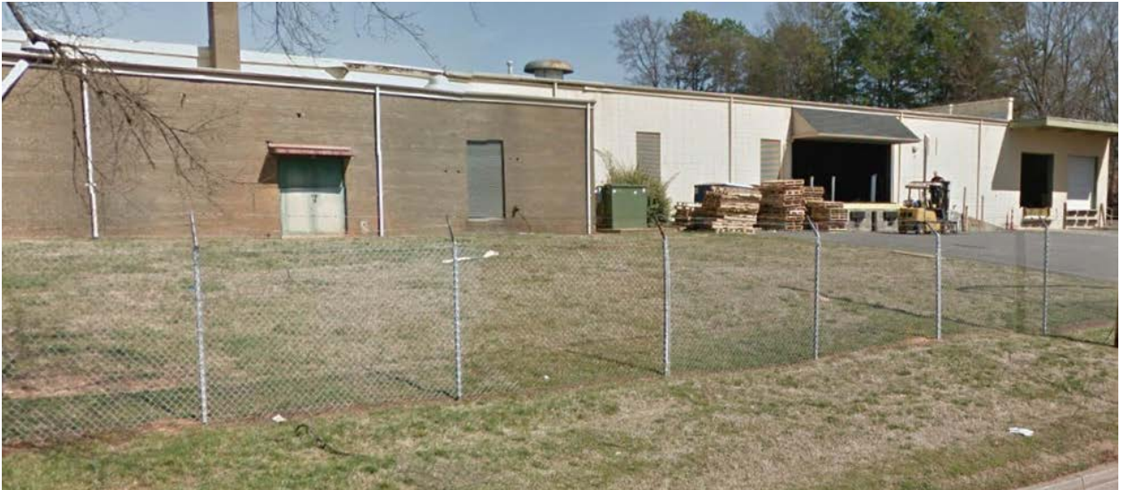
The property is currently developed with office/warehouse uses.