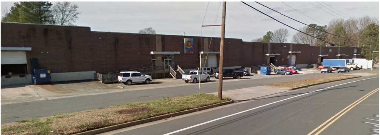
The adjacent property to the north is developed with warehouse uses.