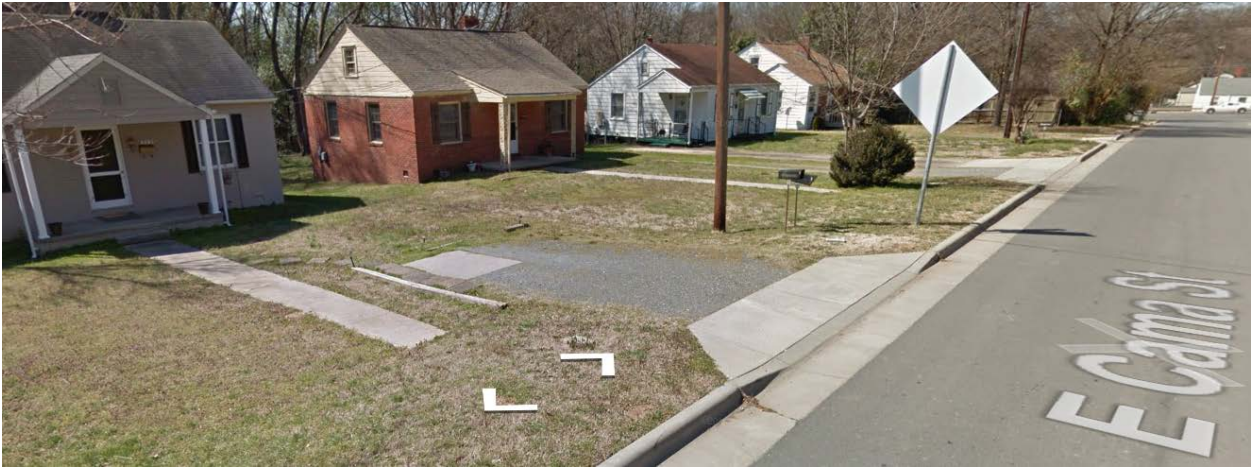
Single family homes are located to the east of the property on East Cama Street.