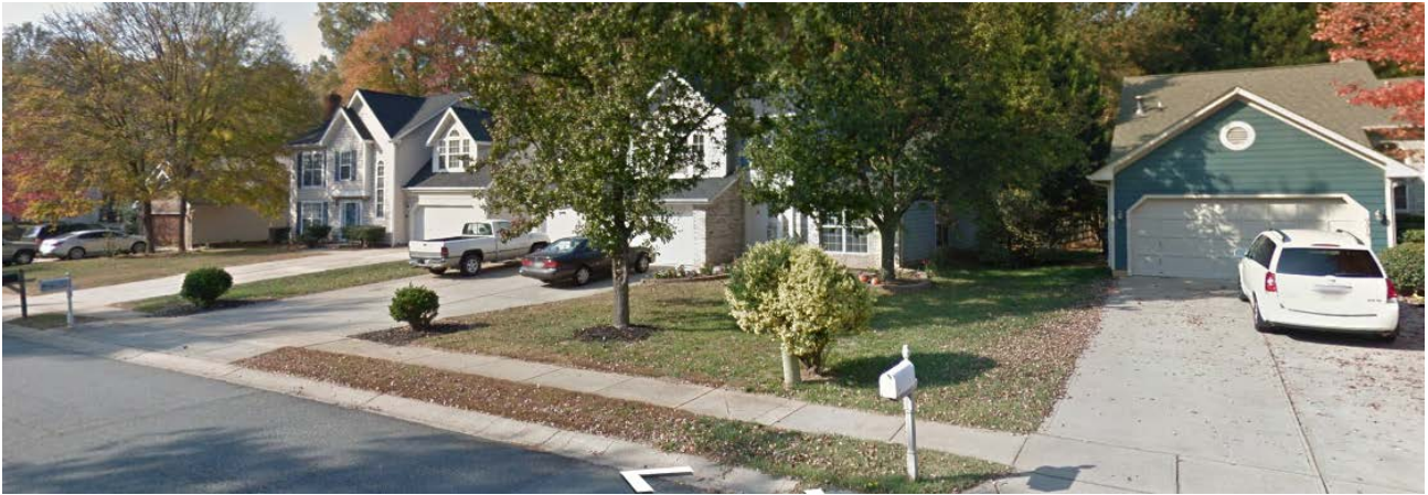
Properties to the north and west are single family residences.