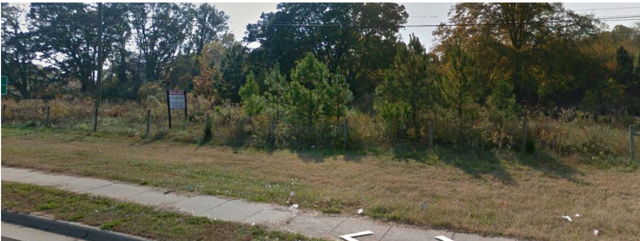
The subject property is vacant.