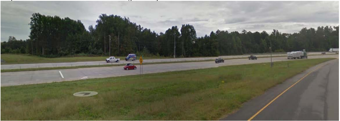
The subject property is bordered by Interstate 485.