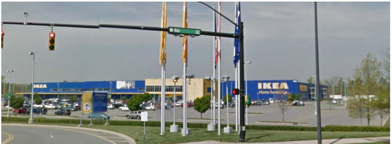
To the south is the Ikea retailer.