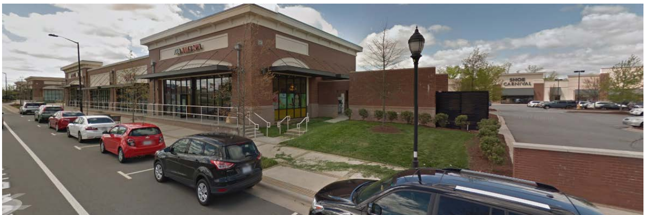
Across Ikea Boulevard from the property is a shopping center.