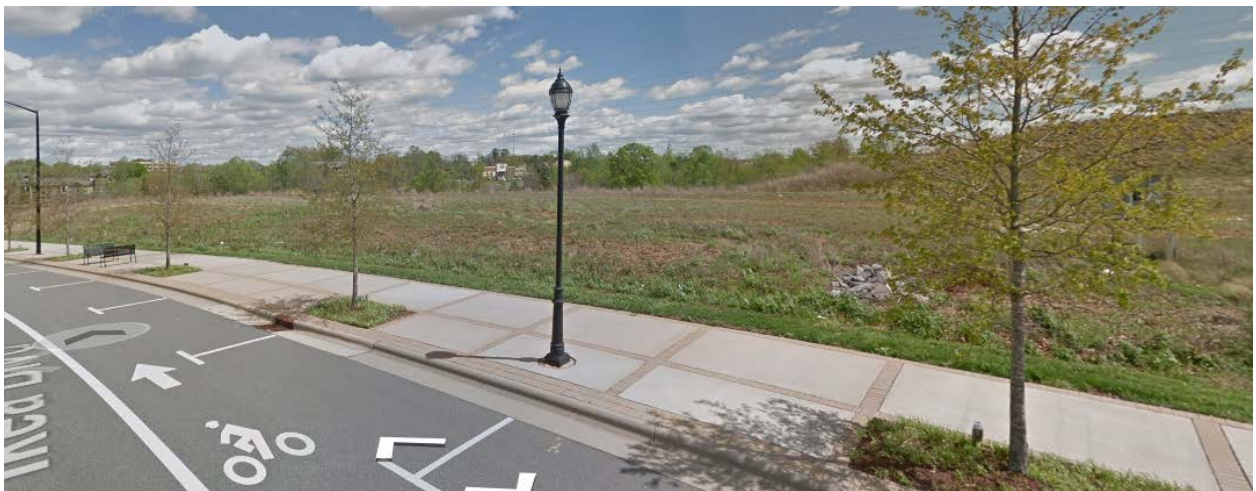
The subject property is vacant.