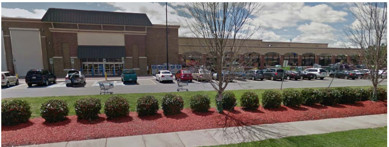
To the east is the Walmart shopping center.