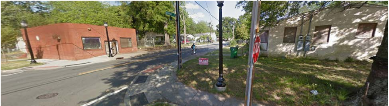
Properties to the south of the subject property include a commercial building and single family residential.