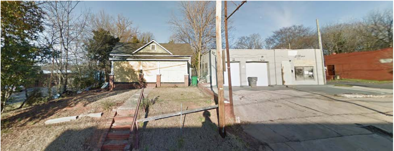
923 Belmont Avenue – A service garage and single family home are located in B-1 (neighborhood business).