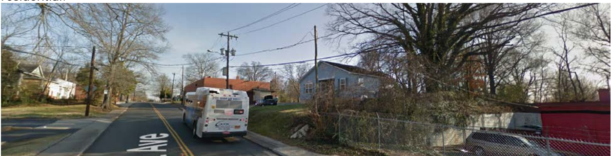
Properties to the north of the subject property include one single family home, a church, and a convenience store.