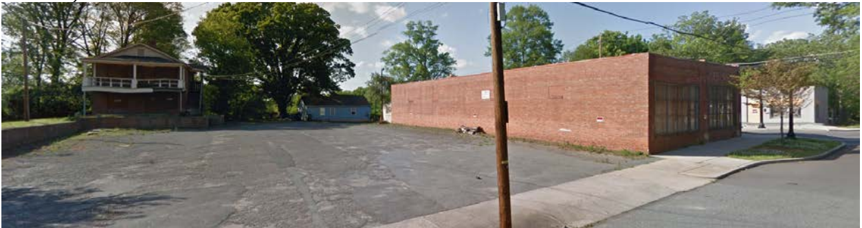
1035 Harrill Street – A commercial structure is located in B-1 (neighborhood business).