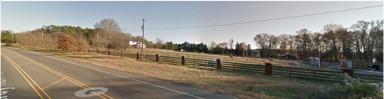
The site is developed with single family homes on large lots.