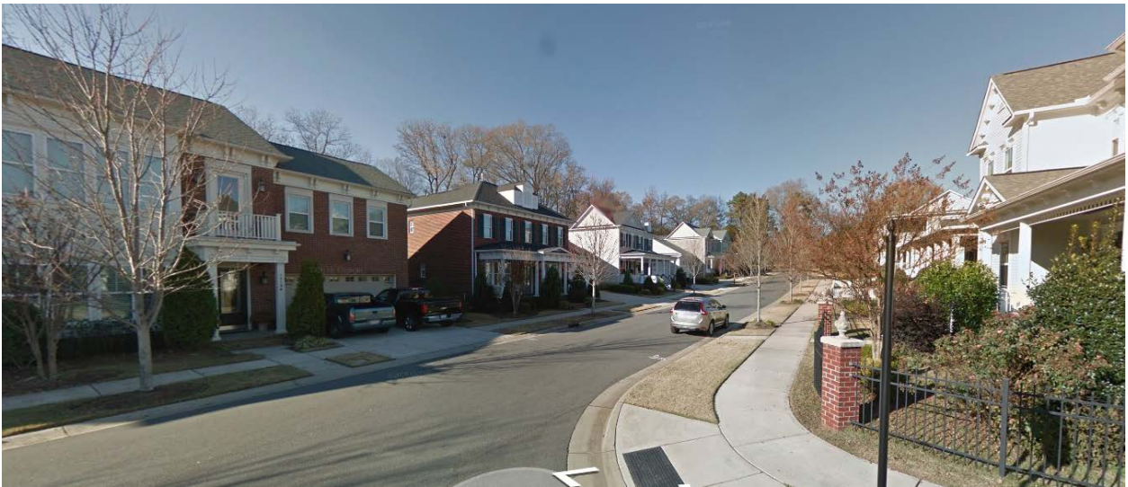
South of the site is a residential development containing a mixture of single family homes and townhomes.