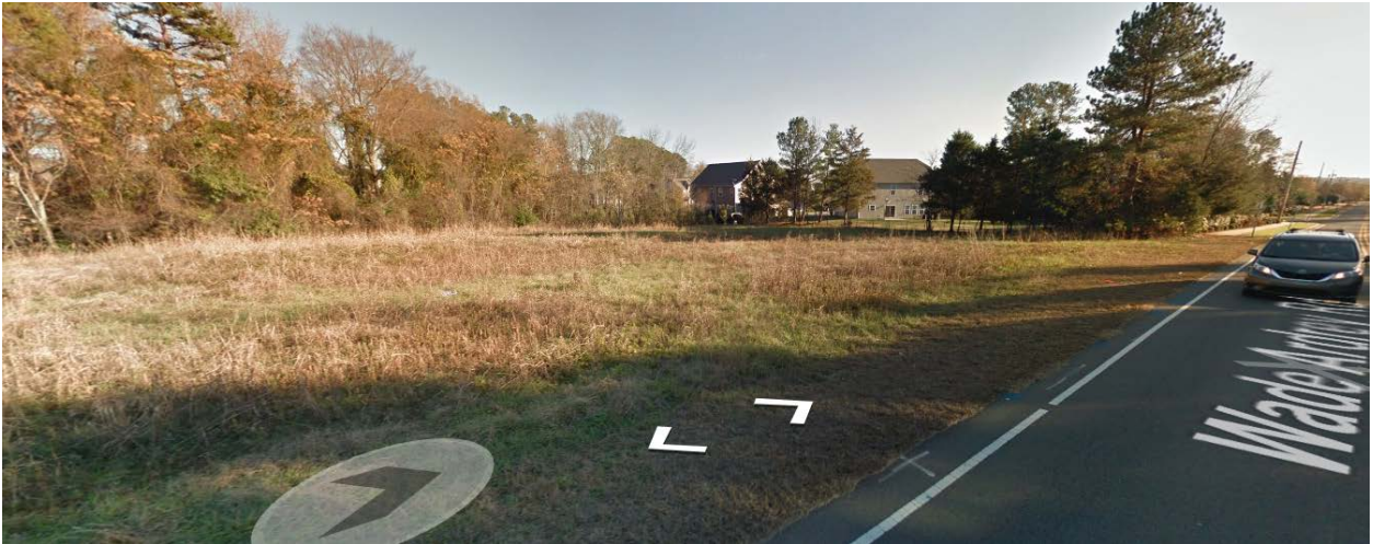
East of the site, across Wade Ardrey Road is a vacant parcel and single family development.