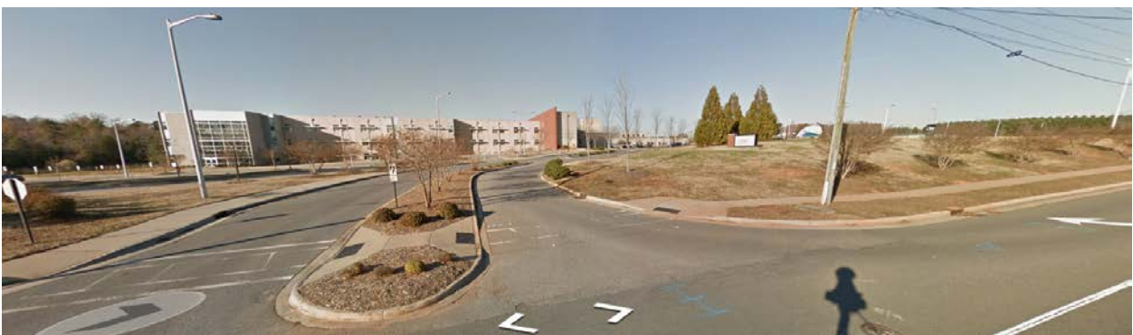
North of the site, across Ardrey Kell Road, is Ardrey Kell High School.