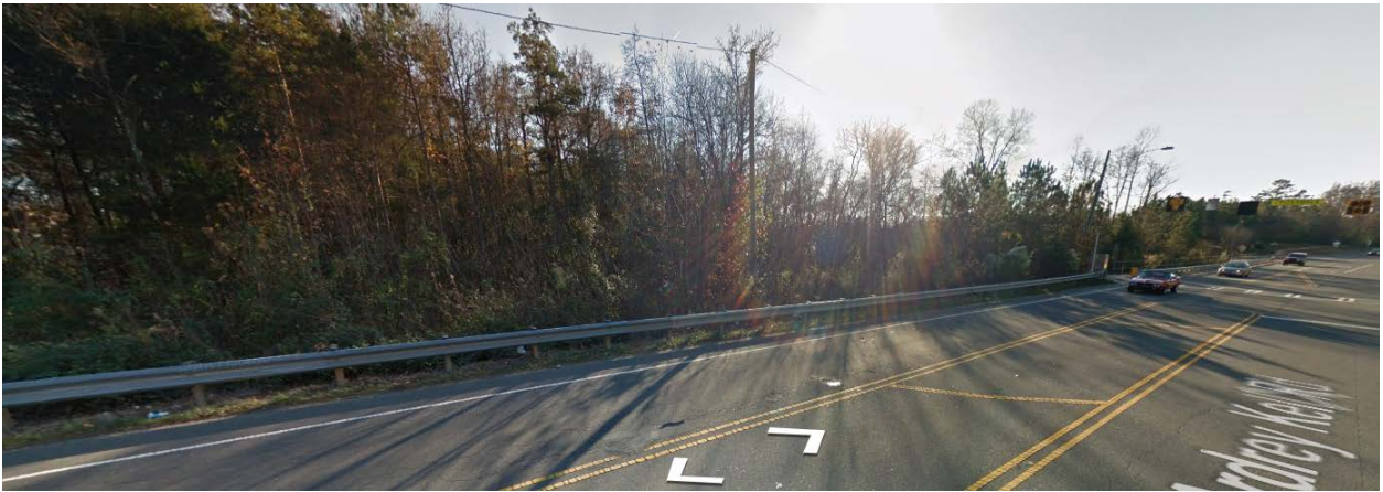
West of the site is a stream buffer along a tributary of Six Mile Creek. Across the creek is single family development.