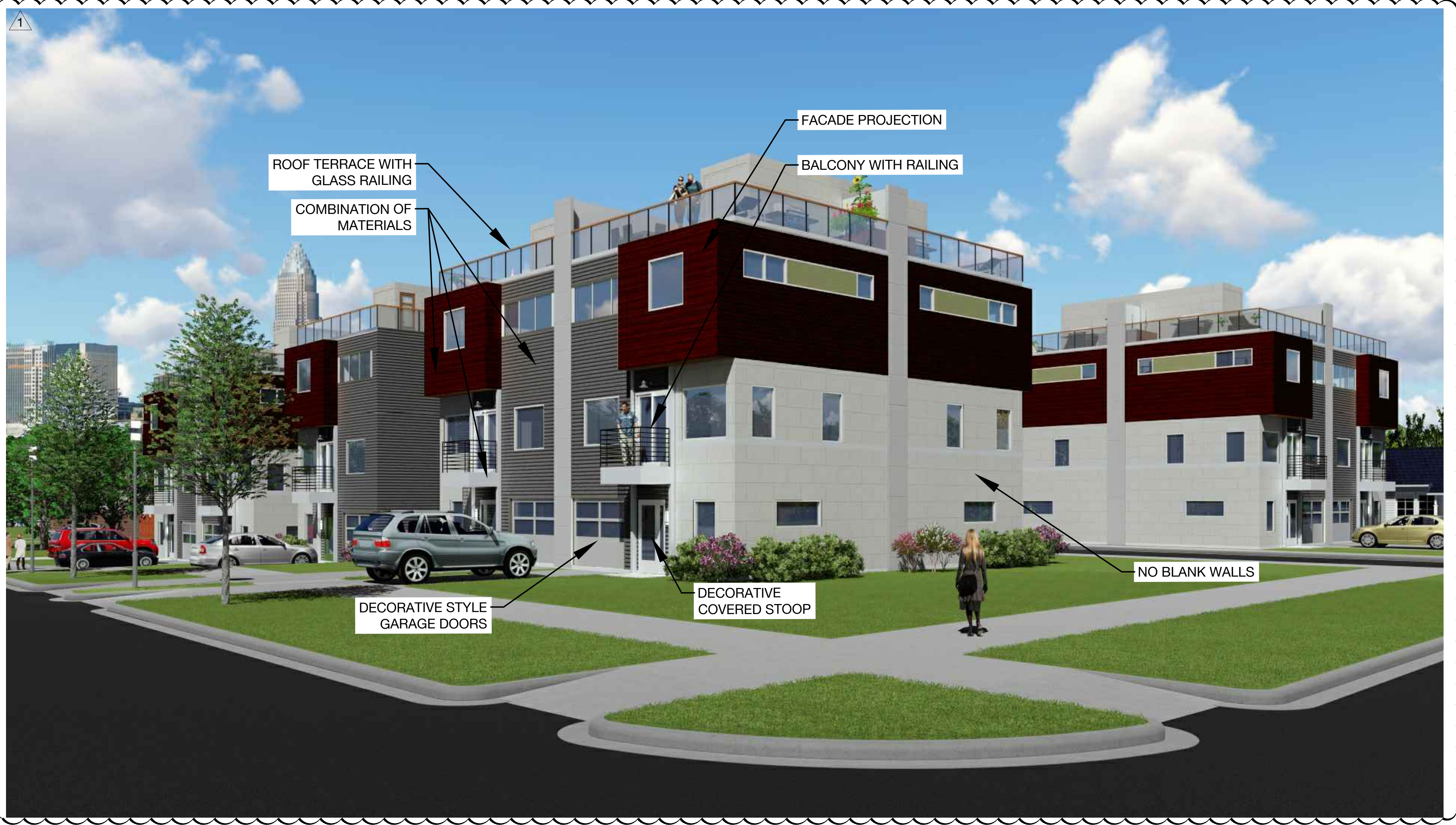
ILLUSTRATIVE EXAMPLE This rendering is provided to reflect the architectural style and quality of the buildings to be constructed on the Site. The actual buildings constructed on the Site may only have minor variations from this elevation that adhere to the general architectural concepts and intent illustrated is maintained.