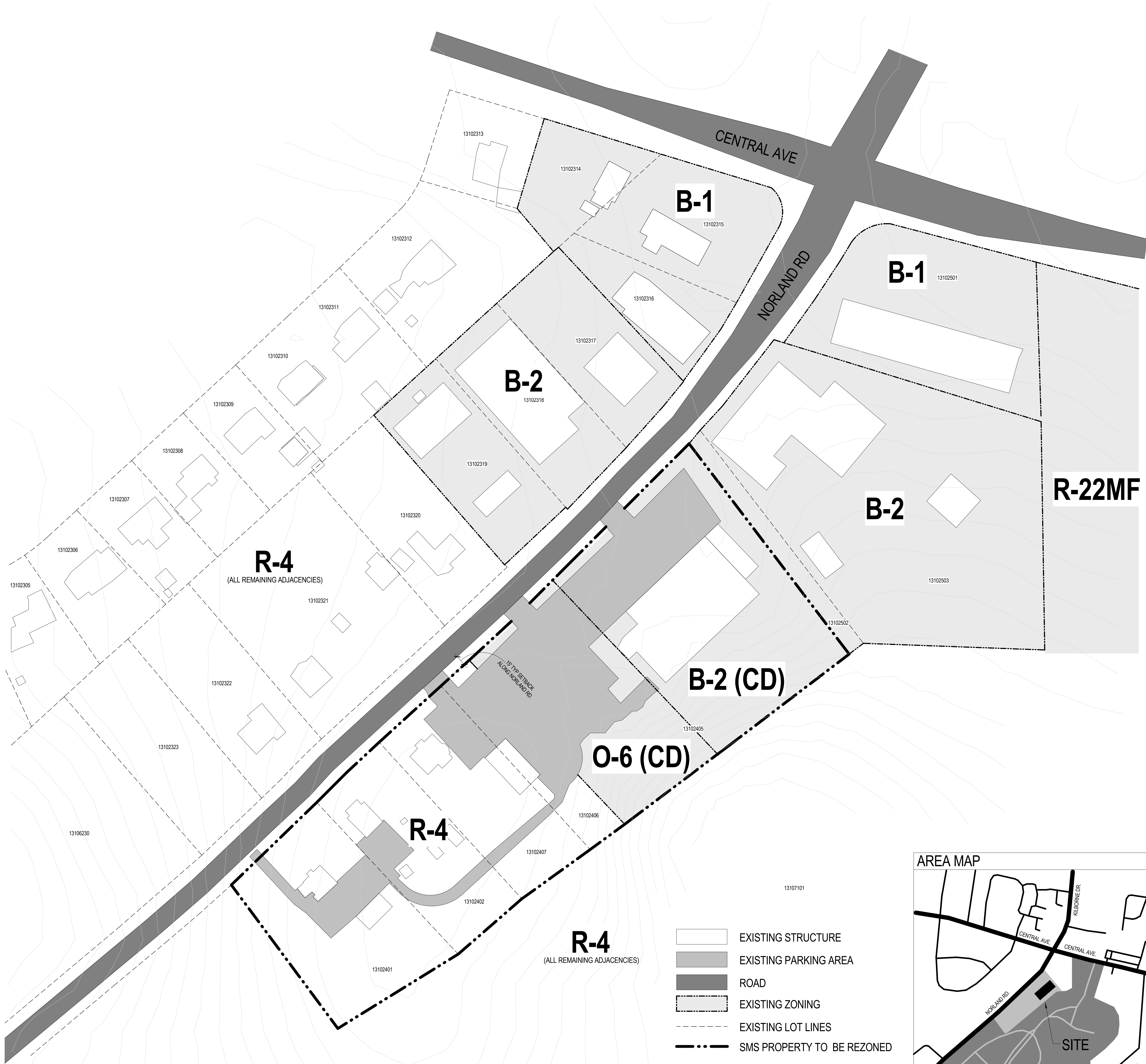
② RZ-1 - EXISTING SITE CONDITIONS SCALE: 1" = 60'-0"

Throughout these Development Standards, the terms, "Petitioner" and "Owner" or "Owners" shall be deemed to include the heirs, devisees, personal representatives, successors in interest and assigns of the Petitioner or the owner or owners of any part of the Site from time to time who may be involved in any future development thereof.