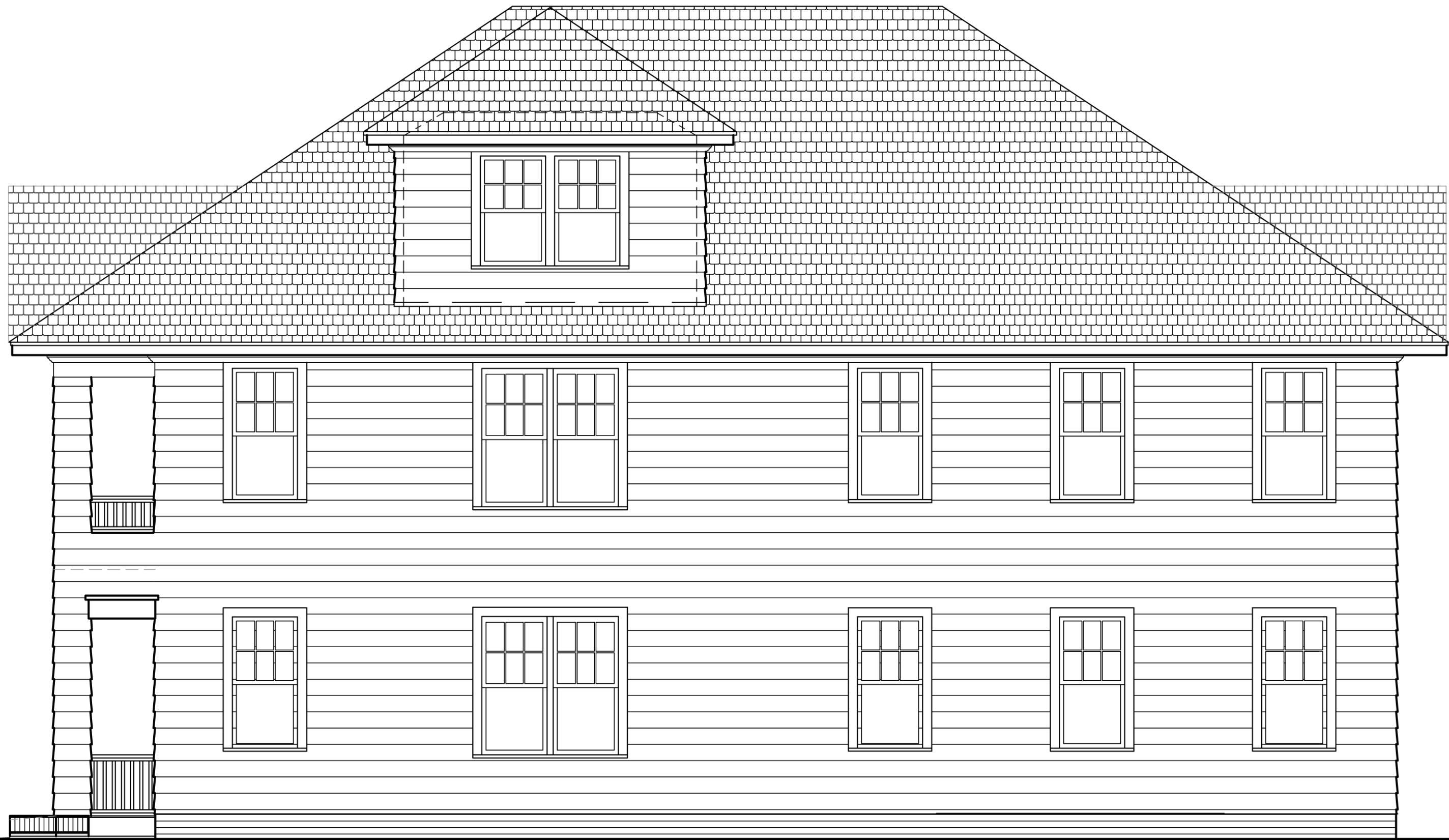
1 A2 TYPICAL SIDE ELEVATION 1/4" = 1'-0"