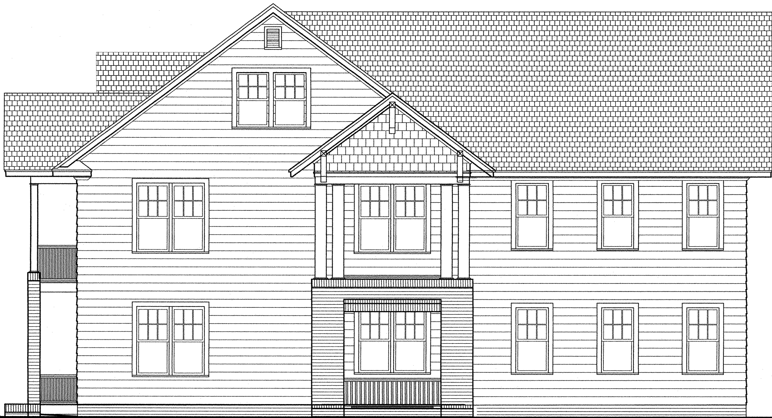
2 A2 ST. JULIEN ELEVATION 1/4" = 1'-0"