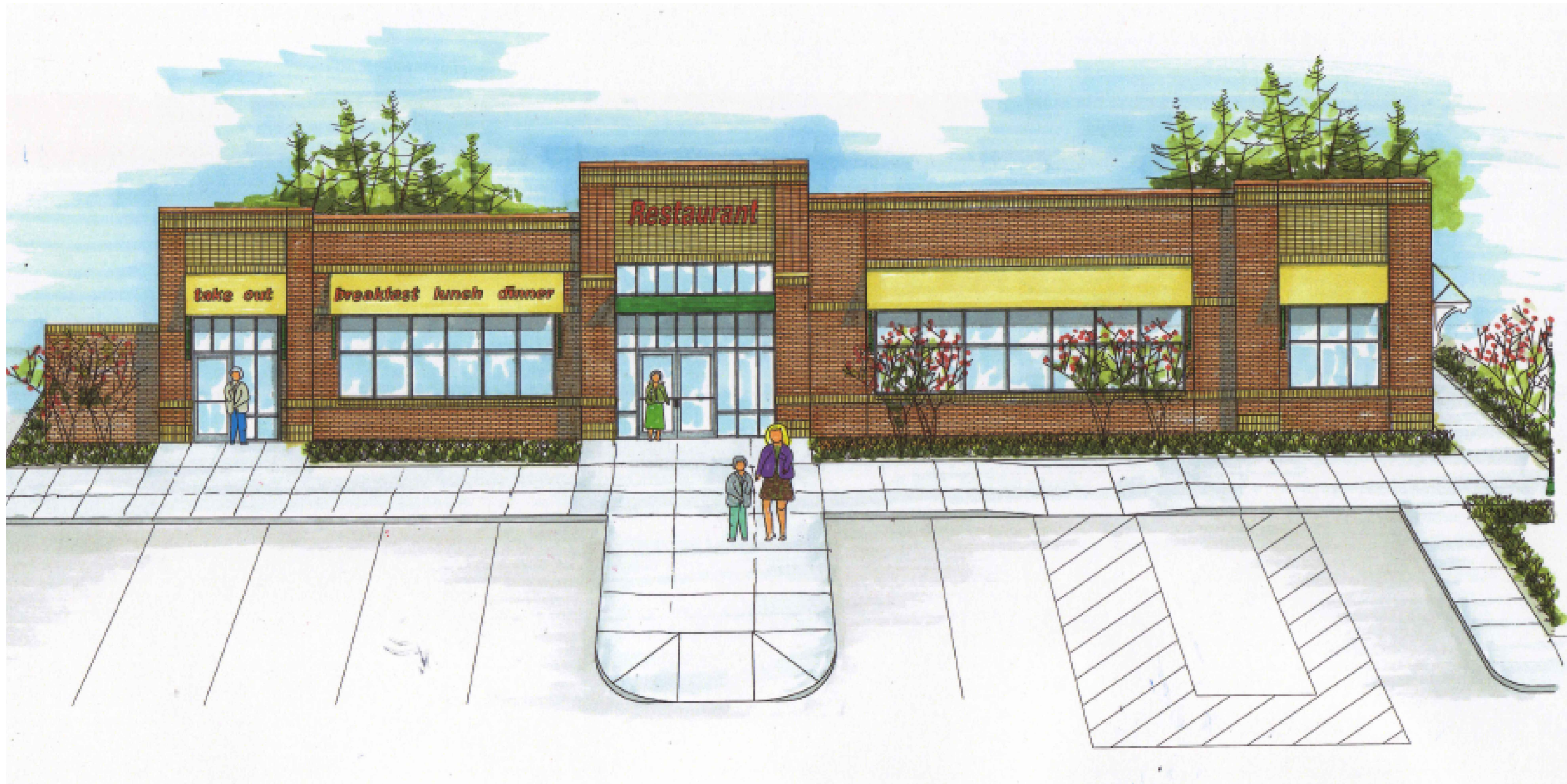
101 SOUTH ELEVATION