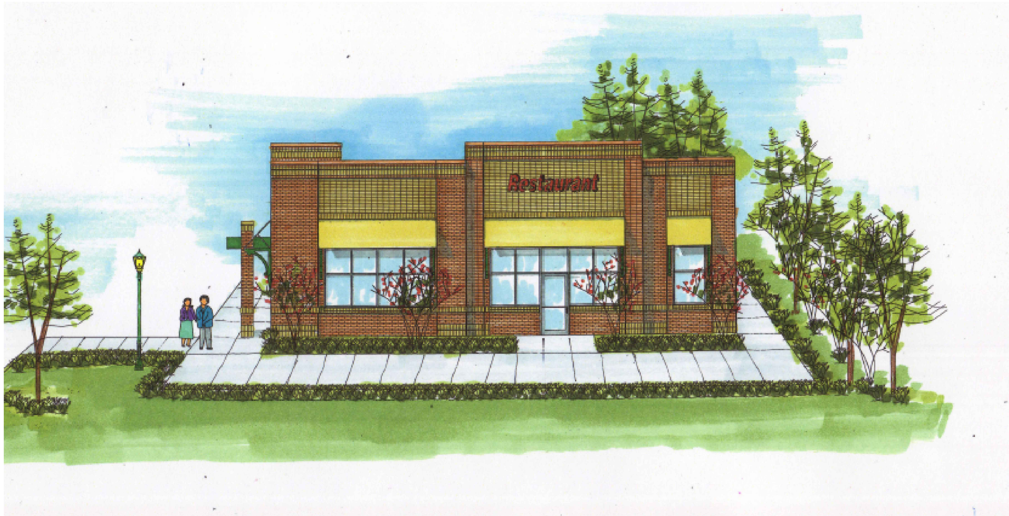
102 EAST ELEVATION

These elevations are provided to reflect the architectural style and quality of the sit down restaurant to be constructed on the Site. The actual building constructed on the Site may have minor variations from this illustration that adhere to the general architectural concepts and intent illustrated is maintained.