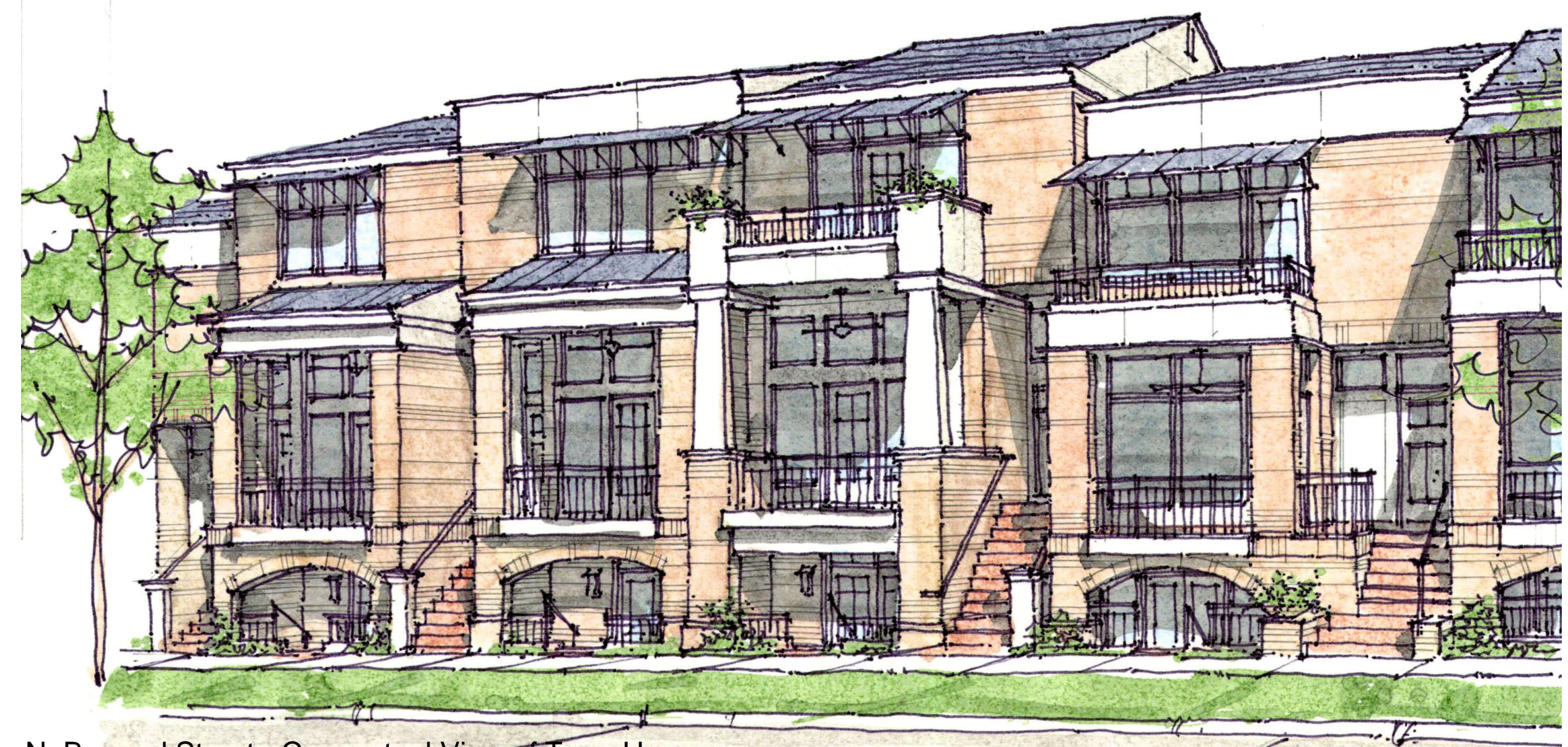
4 N. Brevard Street - Conceptual View of Town Homes Not to Scale