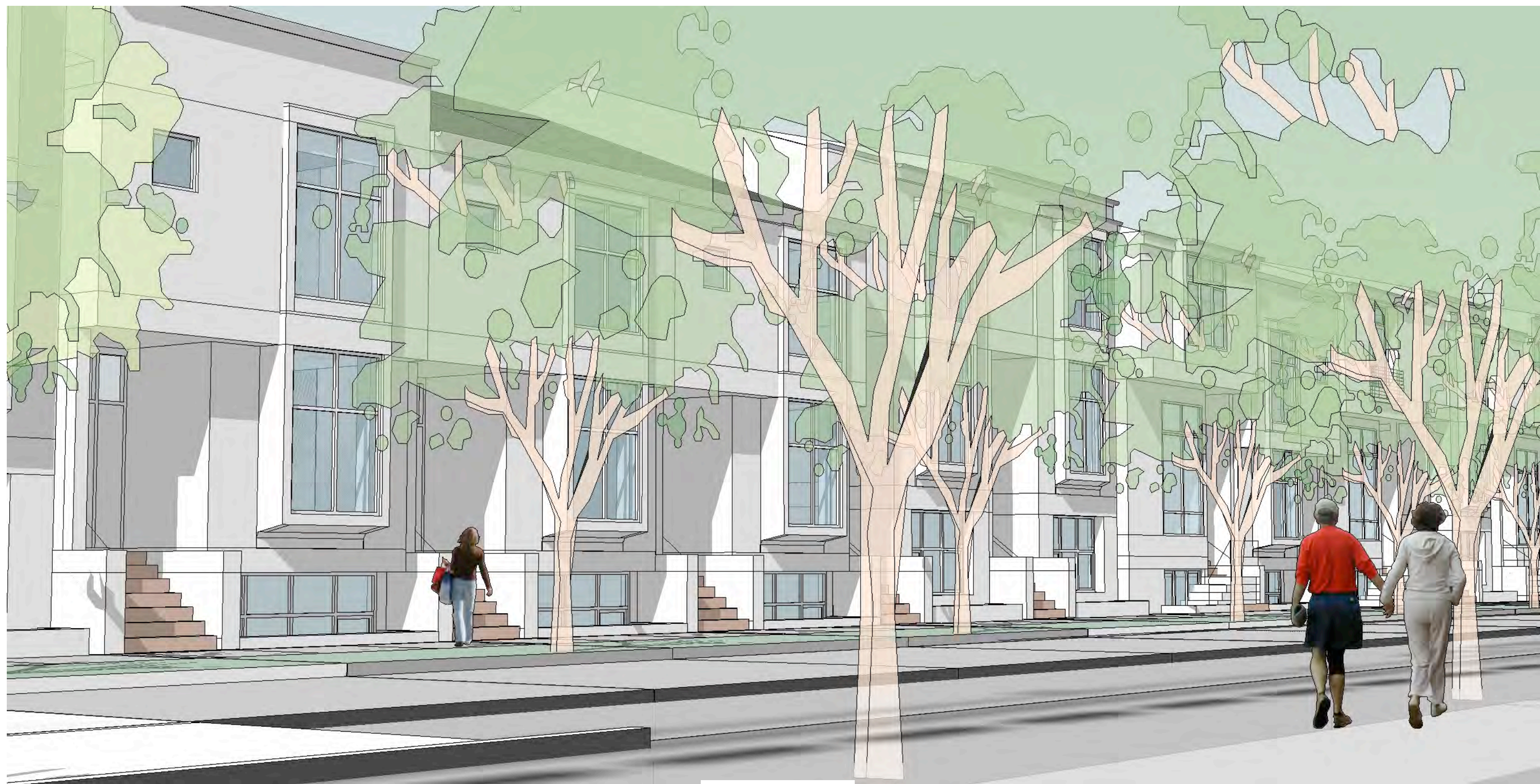
2 E. 33 RD Street - Conceptual Pedestrian Level Street View (Building Massing Only - See 3/ASP04 For Conceptual Materials View) Not to Scale