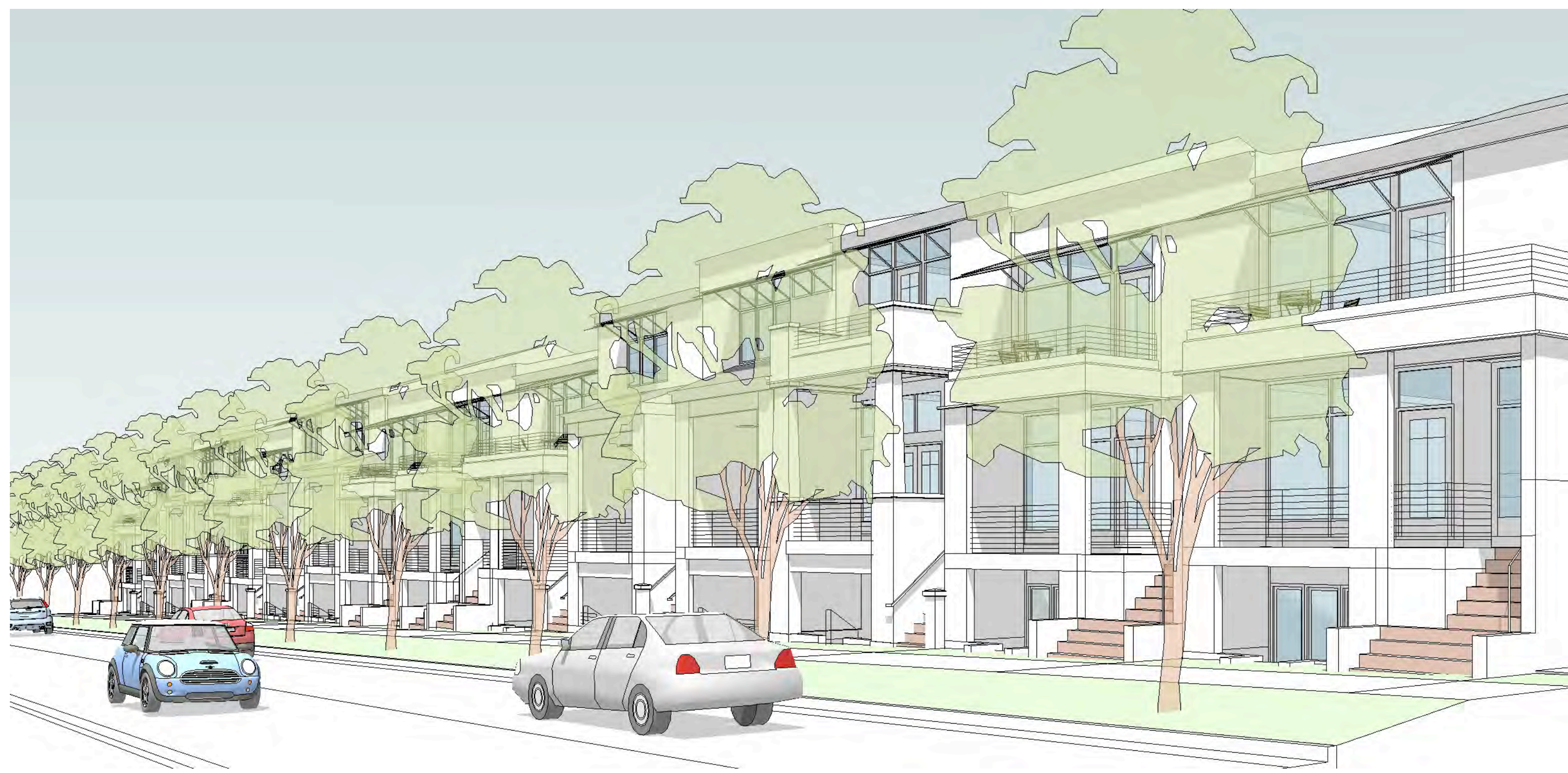
1 N. Brevard Street - Conceptual Pedestrian Level Street View (Building Massing Only - See 4/ASP04 For Conceptual Materials View) Not to Scale