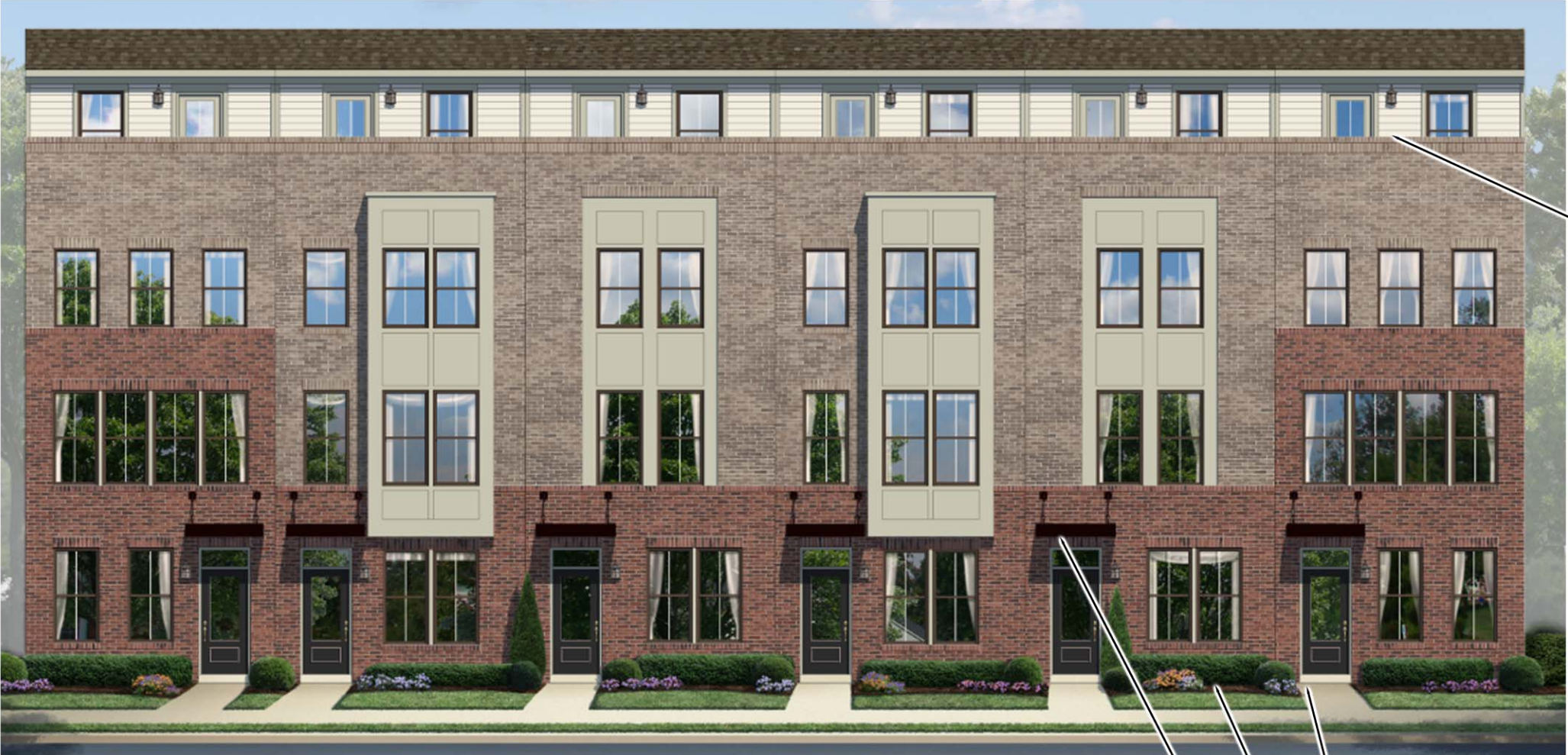
TYPICAL FRONT ELEVATION (36TH STREET AND HOLT STREET)

G:\SDSK\PROJ\090-021 36TH AND HOLT ST - DRAKEFORD\DWG\DRG - BASE DRAWINGS\B-SP.DWG