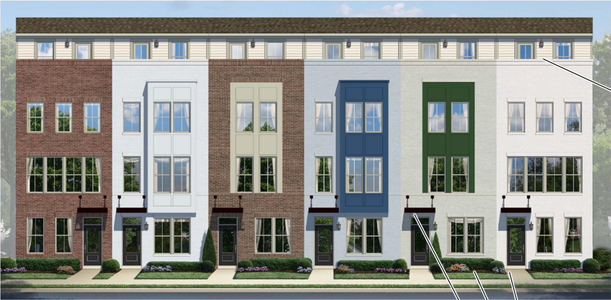
TYPICAL FRONT ELEVATION (36TH STREET AND HOLT STREET)

G:\SDSK\PROJ\090-021 36TH AND HOLT ST - DRAKEFORD\DWG\DRG - BASE DRAWINGS\B-SP-DWG