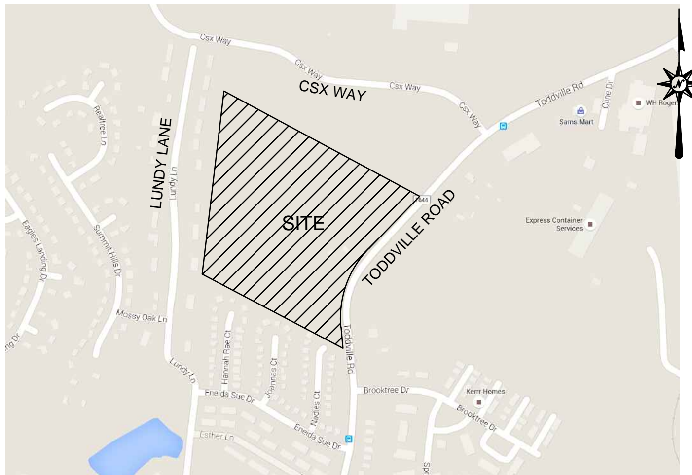
SITE PLAN 2016-057

FEDEX GROUND PACKAGE SYSTEM, INC. 1000 FEDEX DRIVE MOON TOWNSHIP, PA 15108