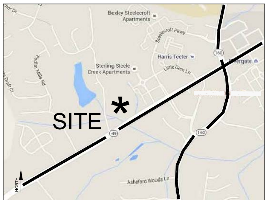
VICINITY MAP - NTS

PROPOSED ZONING: BD (CD) PROPOSED USE: CLIMATE CONTROLLED, ENCLOSED STORAGE FACILITY AND ACCESS TO ADJACENT PROPERTY MAXIMUM BUILDING AREA: 100,000 Sq. Ft. BUILDING HEIGHT: PER ORDINANCE REQUIREMENT MINIMUM PARKING REQUIRED: PER ORDINANCE REQUIREMENT MINIMUM TREE SAVE: PER ORDINANCE REQUIREMENT SETBACKS, SIDEYARDS, REAR YARD, AND BUFFERS: PER ORDINANCE REQUIREMENT