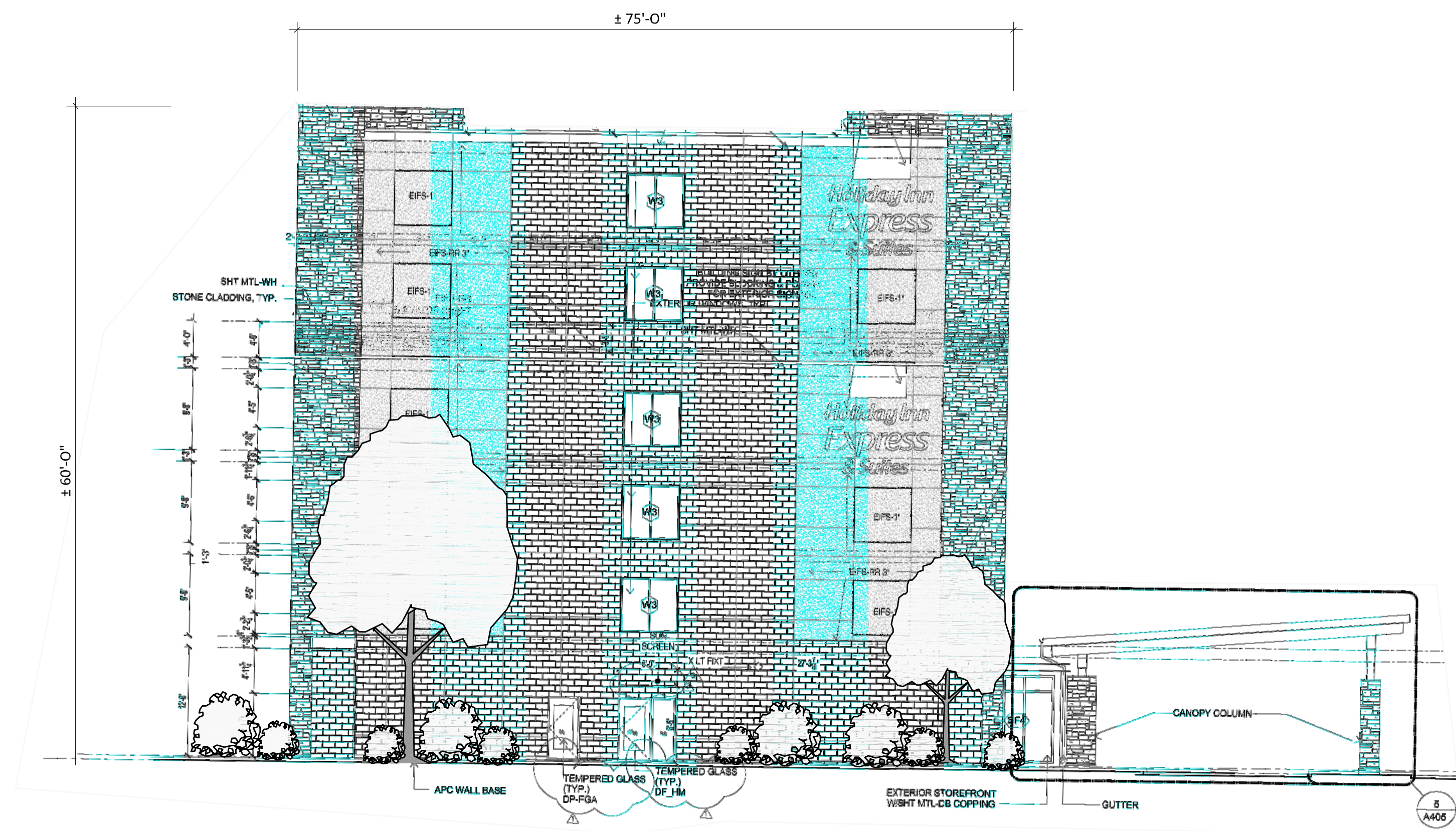
CONCEPTUAL LEFT SIDE ELEVATION OF HOTEL (FACING NATIONS FORD ROAD)