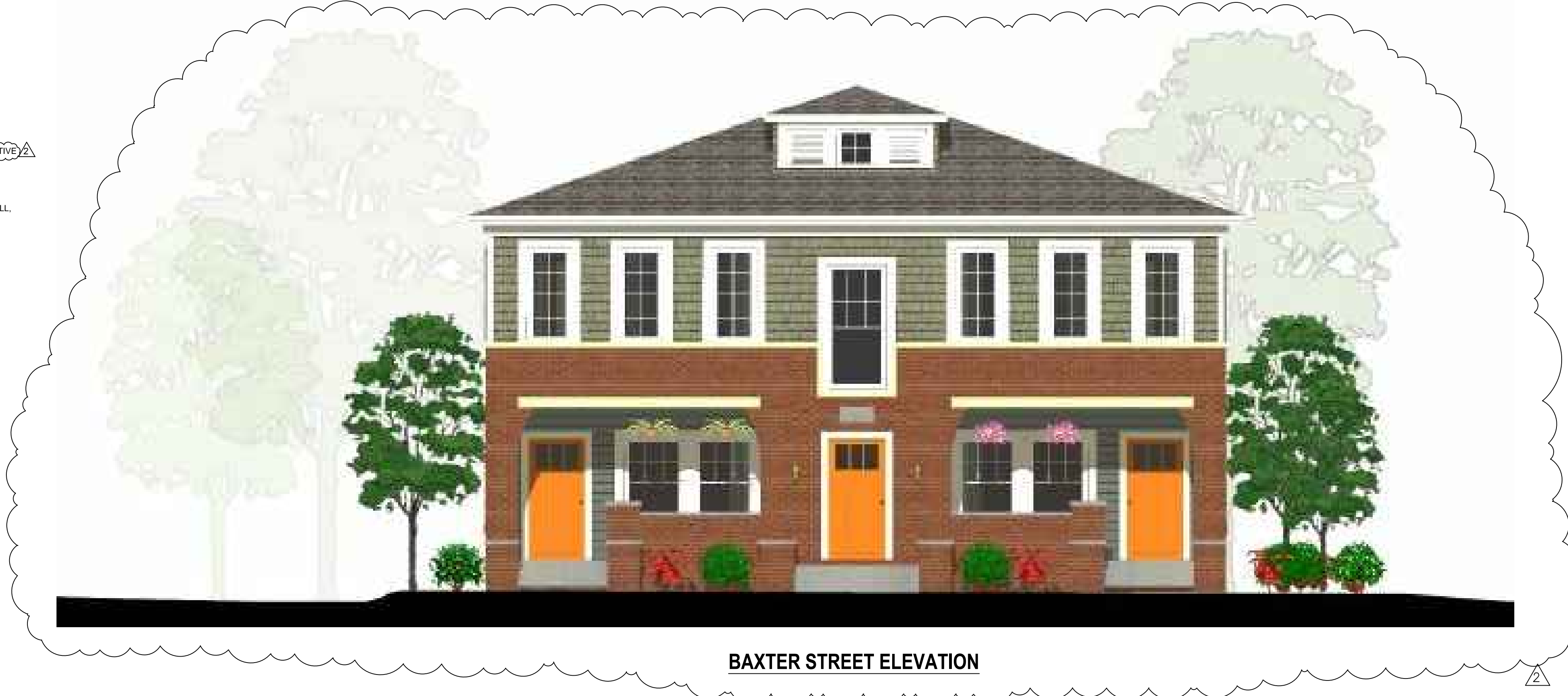
BAXTER STREET ELEVATION