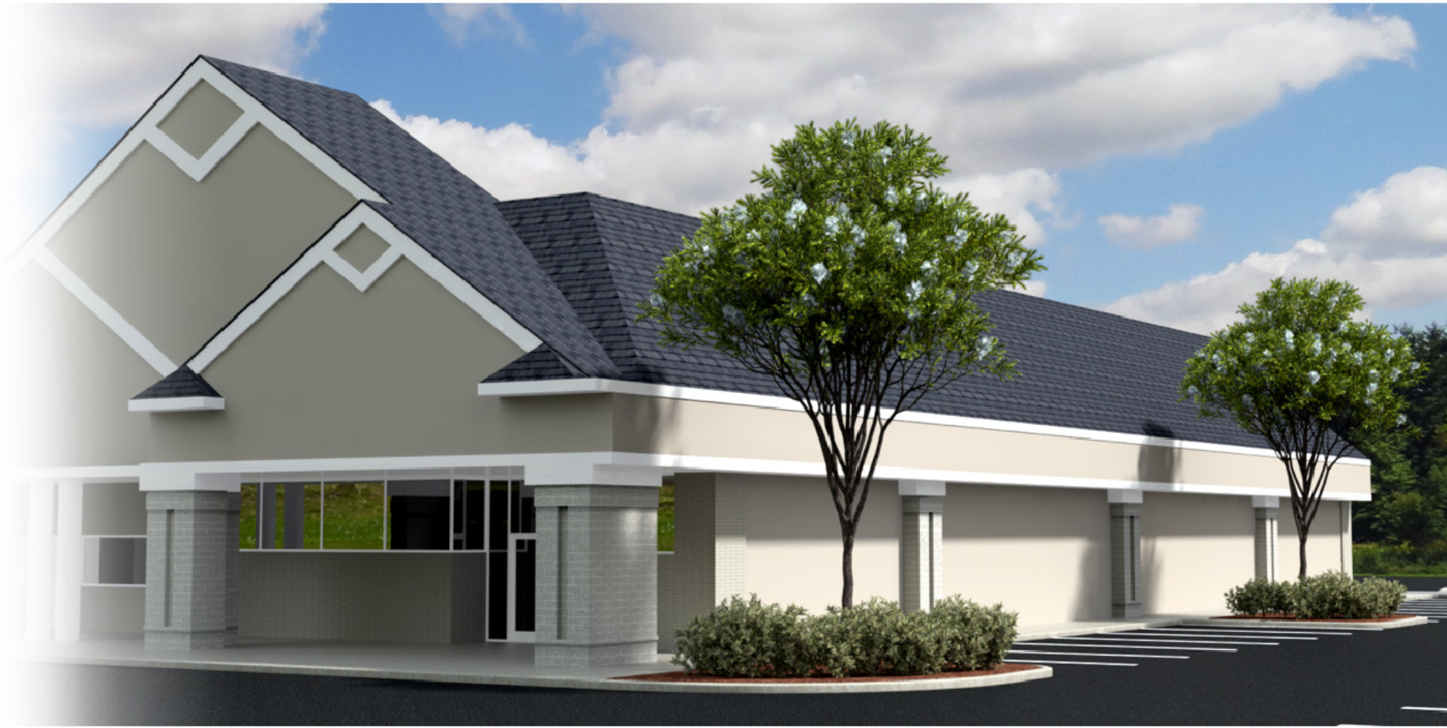
Touchstone Retail | 5

InVue Corporate Campus at Touchstone | 2