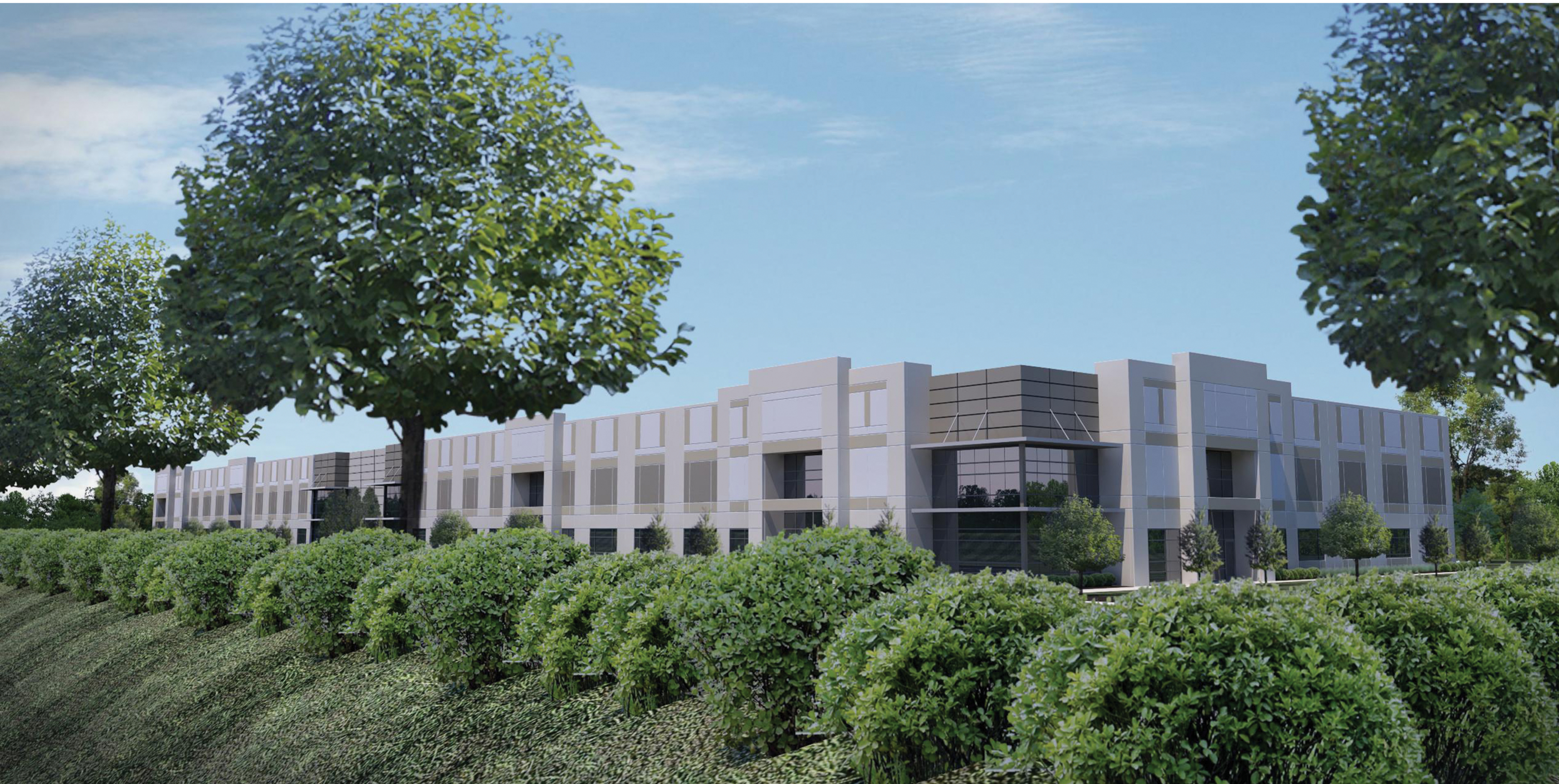
ALTERNATIVE GABLE ROAD ELEVATION - BUILDING 6