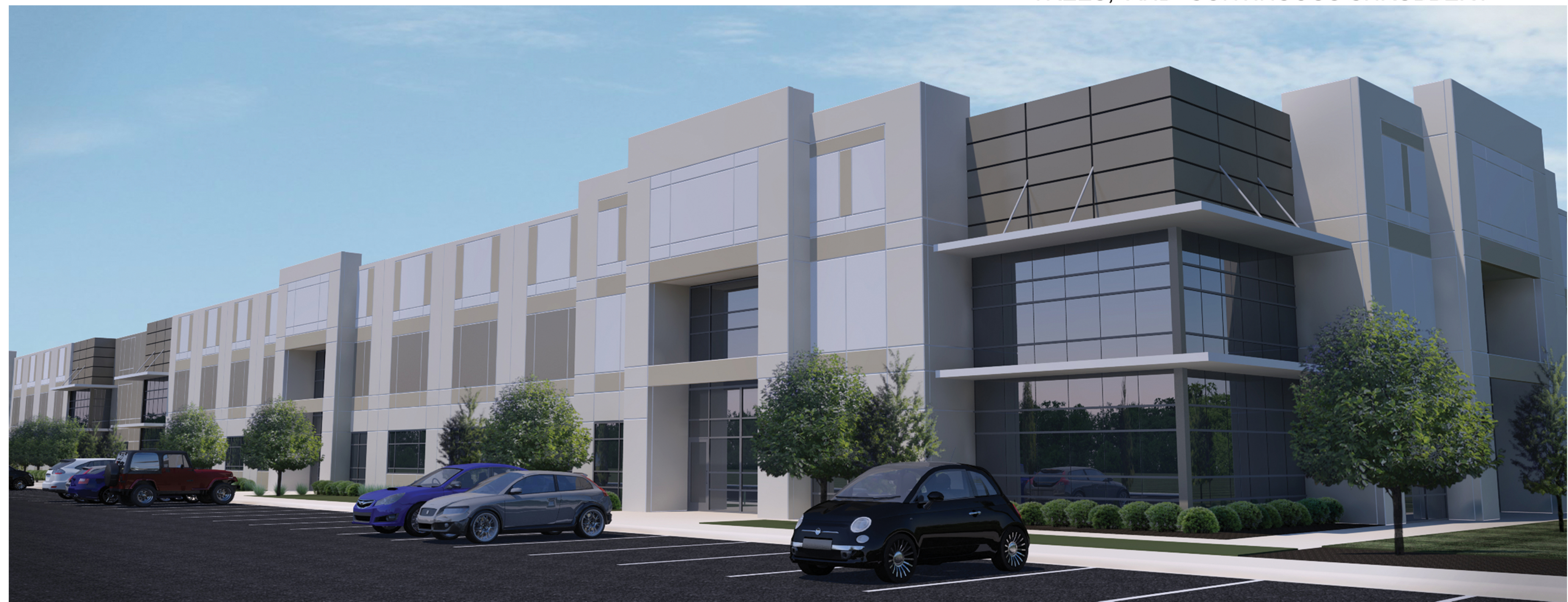
BUILDING 7 ELEVATION FACING I-485

4' HIGH HEAVILY LANDSCAPED BERM WITH DENSE DECIDUOUS AND EVERGREEN TREES, AND CONTINUOUS SHRUBBERY