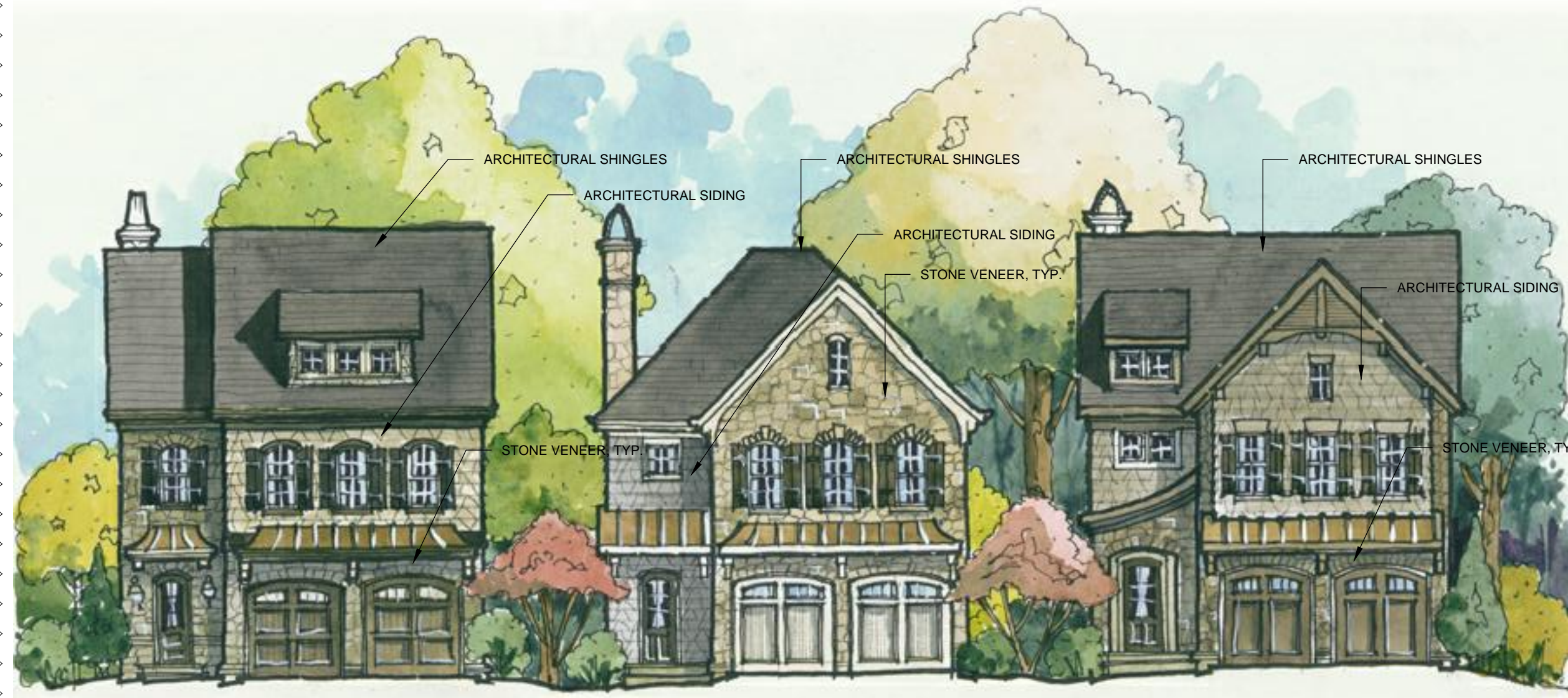
Proposed Architectural Elevations