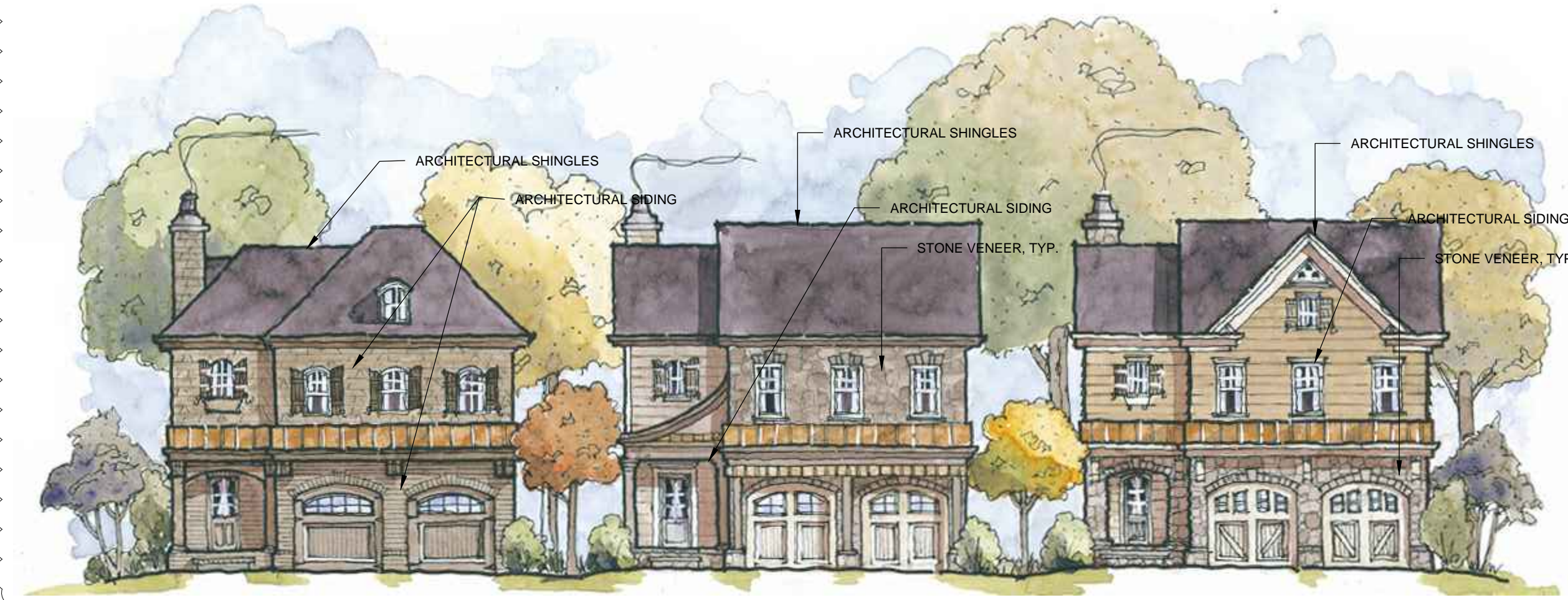
Proposed Architectural Elevations