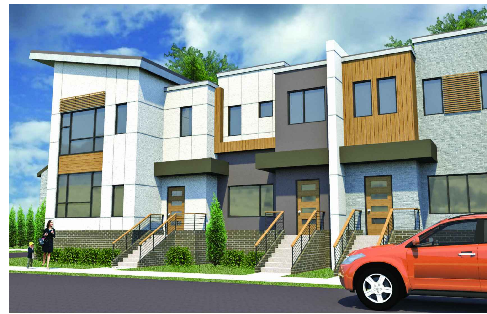
01 TYPICAL IMAGE OF EXTERIOR

Tax Parcel ID#: 171-011-52 Total Site Acreage: 1.58 acres Existing Zoning: R-4 Existing Uses: Single Family Proposed Zoning: UR-2 (CD) Proposed Uses: Multi-Family Residential