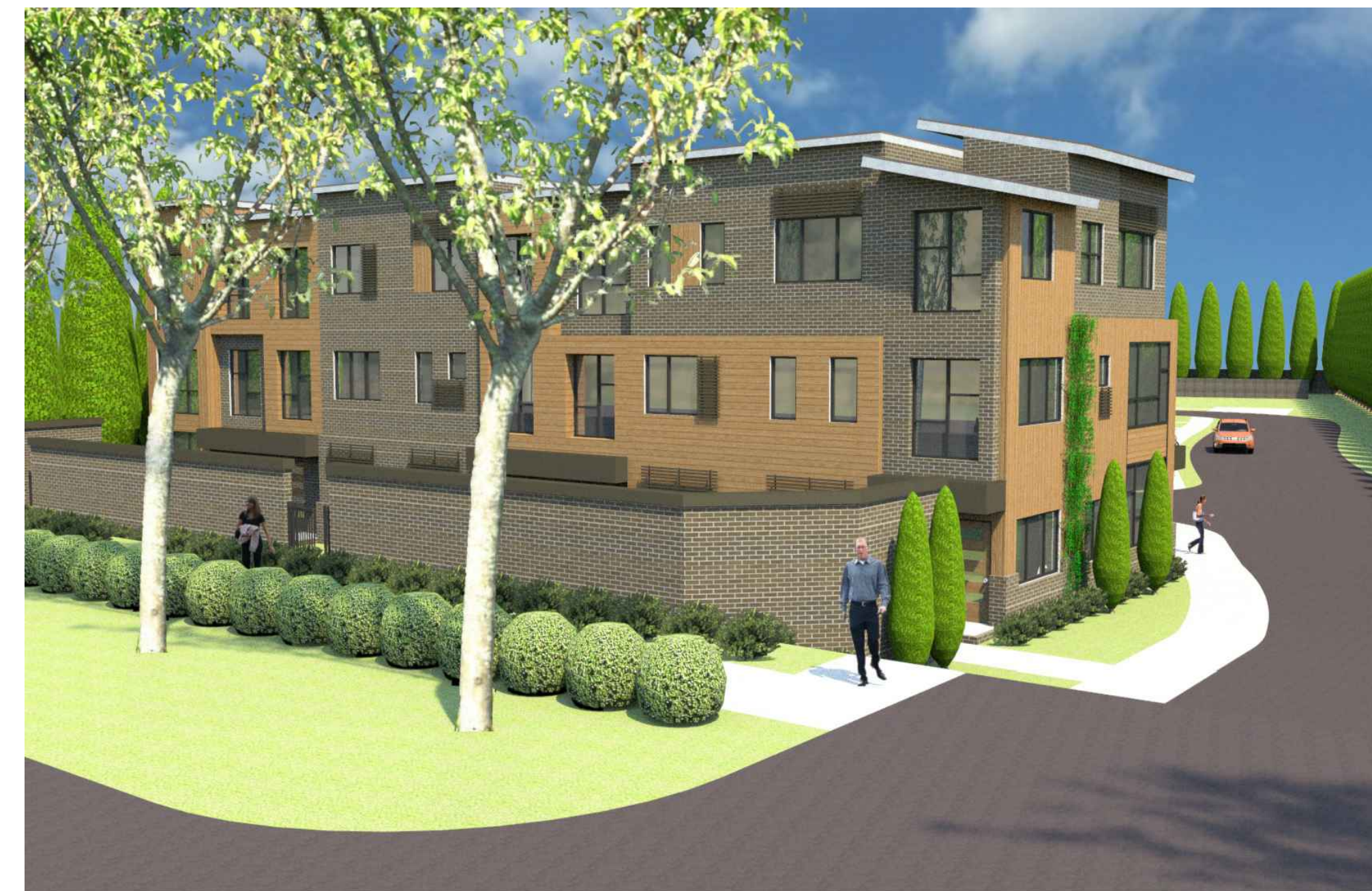
03 VIEW FROM WOODLAWN