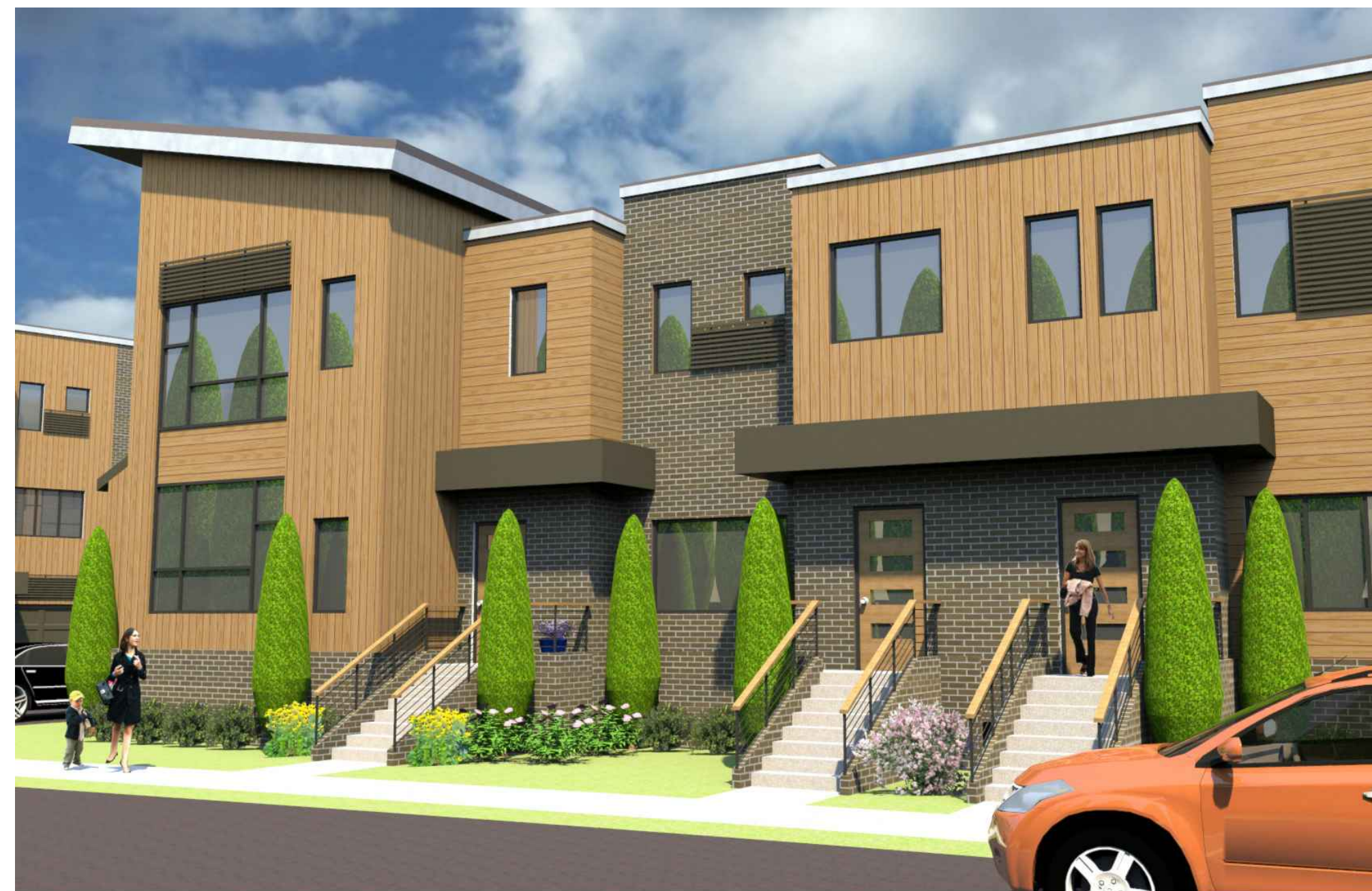
02 TYPICAL IMAGE OF EXTERIOR