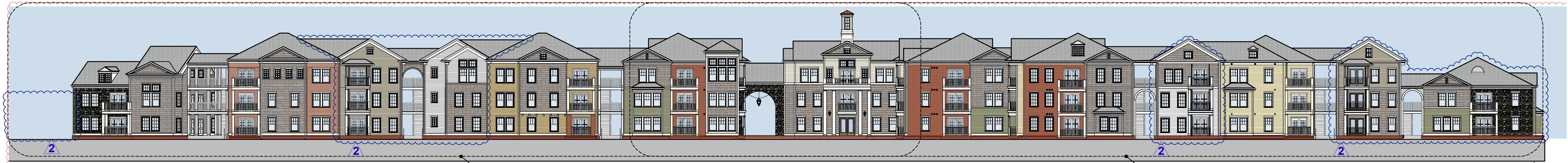
1 Weddington Road Overall East Building Elevation Not to Scale