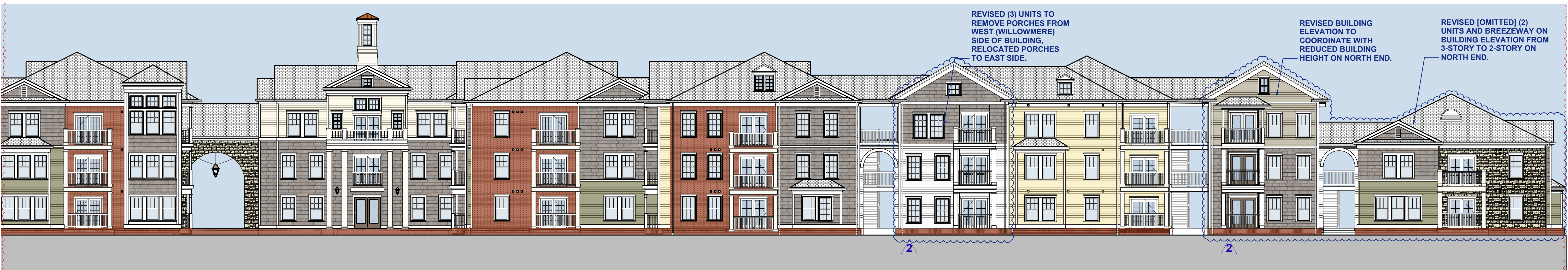
1B Weddington Rd Partial Enlarged East Elevation-North Wing Scale: 3/32" = 1'-0"