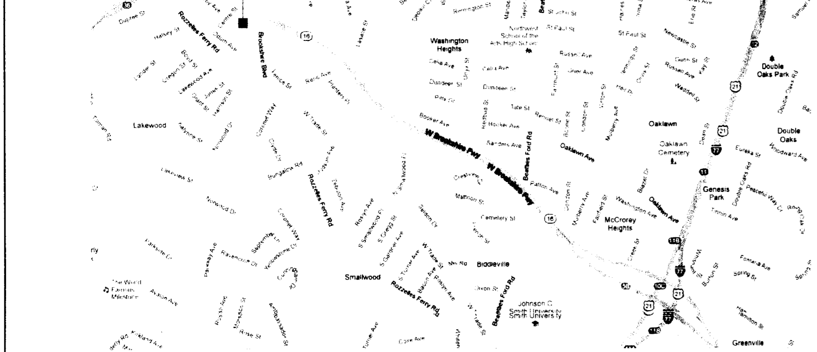
2 Vacinity Map NTS