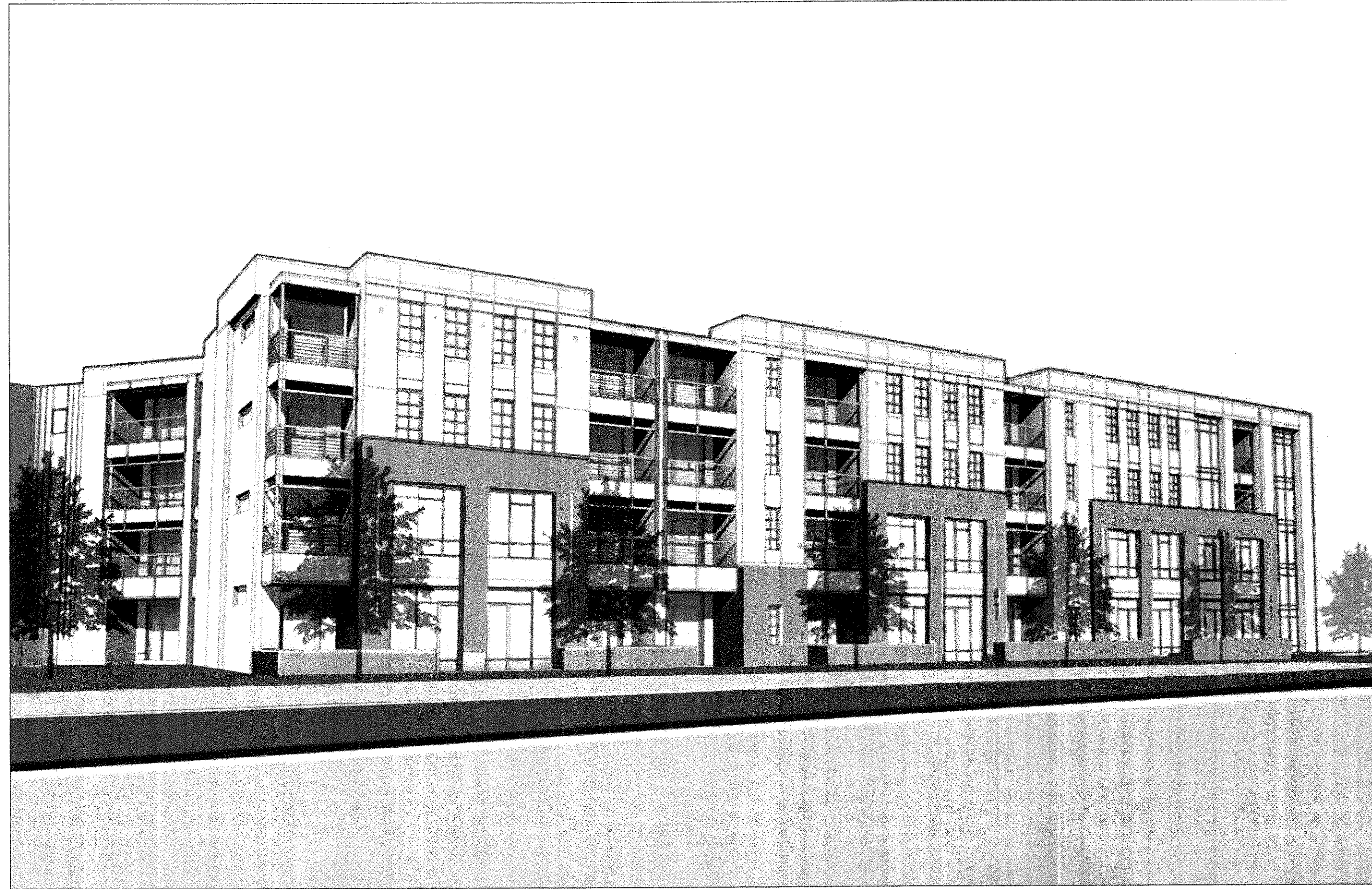
SCHEMATIC PERSPECTIVE VIEW - MERCURY STREET