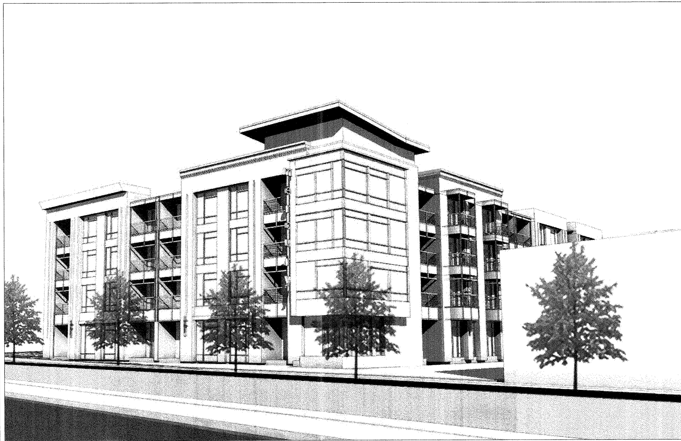
SCHEMATIC PERSPECTIVE VIEW - NORTH DAVIDSON STREET