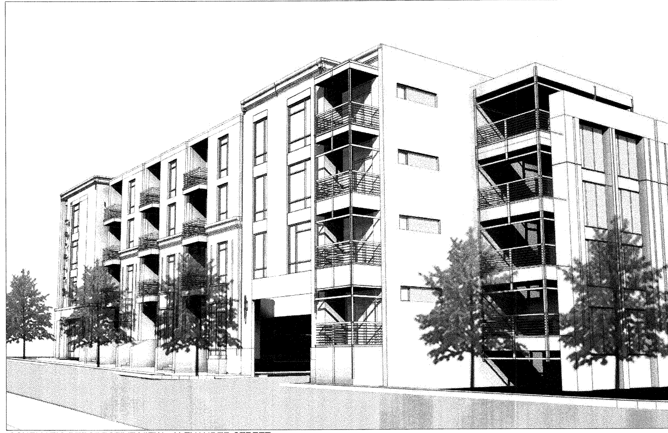
SCHEMATIC PERSPECTIVE VIEW - ALEXANDER STREET

NOTE: THE REZONING PLAN IS ILLUSTRATIVE IN NATURE AND IS INTENDED TO DEPICT BUILDING, PARKING AND CIRCULATION RELATIONSHIPS.