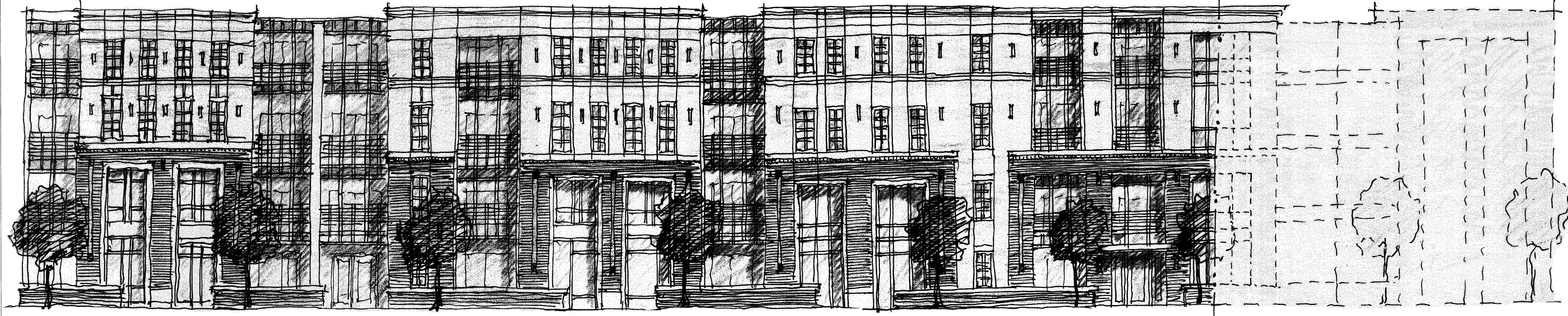
DETAILED SCHEMATIC ELEVATION - MERCURY STREET

NOTE: THE REZONING PLAN IS ILLUSTRATIVE IN NATURE AND IS INTENDED TO DEPICT BUILDING, PARKING AND CIRCULATION RELATIONSHIPS.