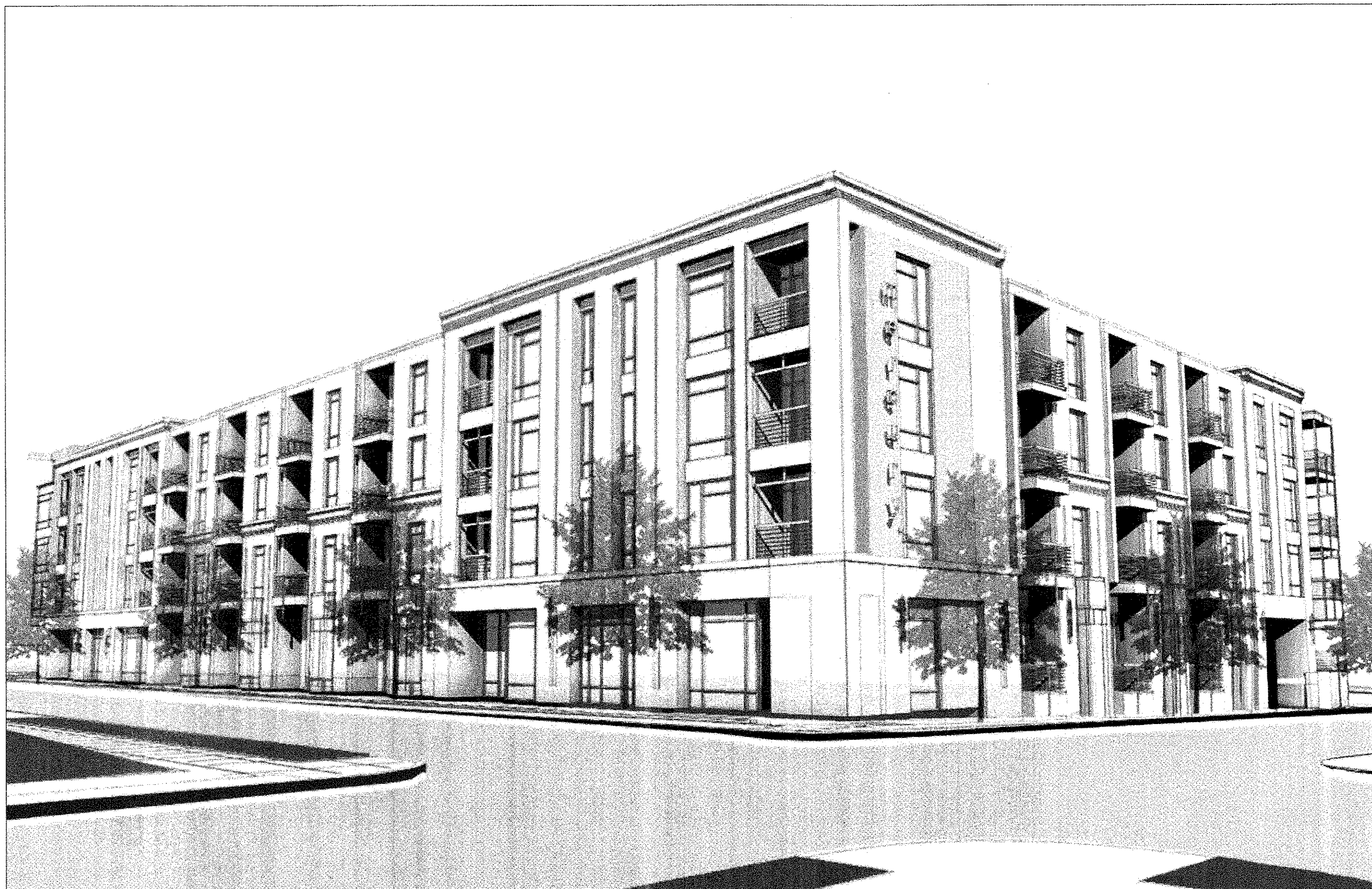
SCHEMATIC PERSPECTIVE VIEW - 36th STREET AND ALEXANDER STREET INTERSECTION