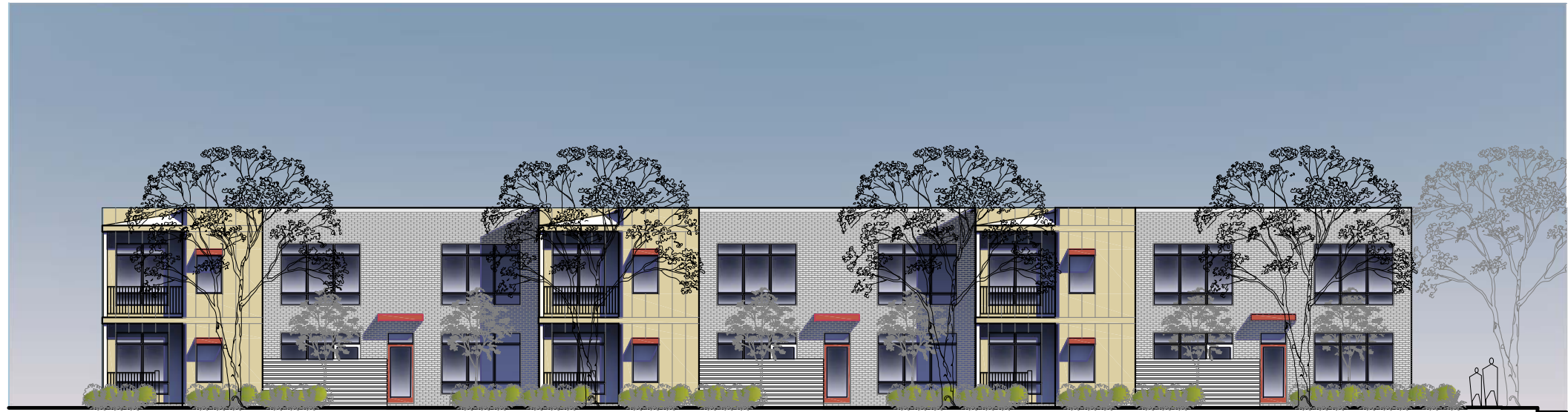
EAST 18TH STREET ELEVATION