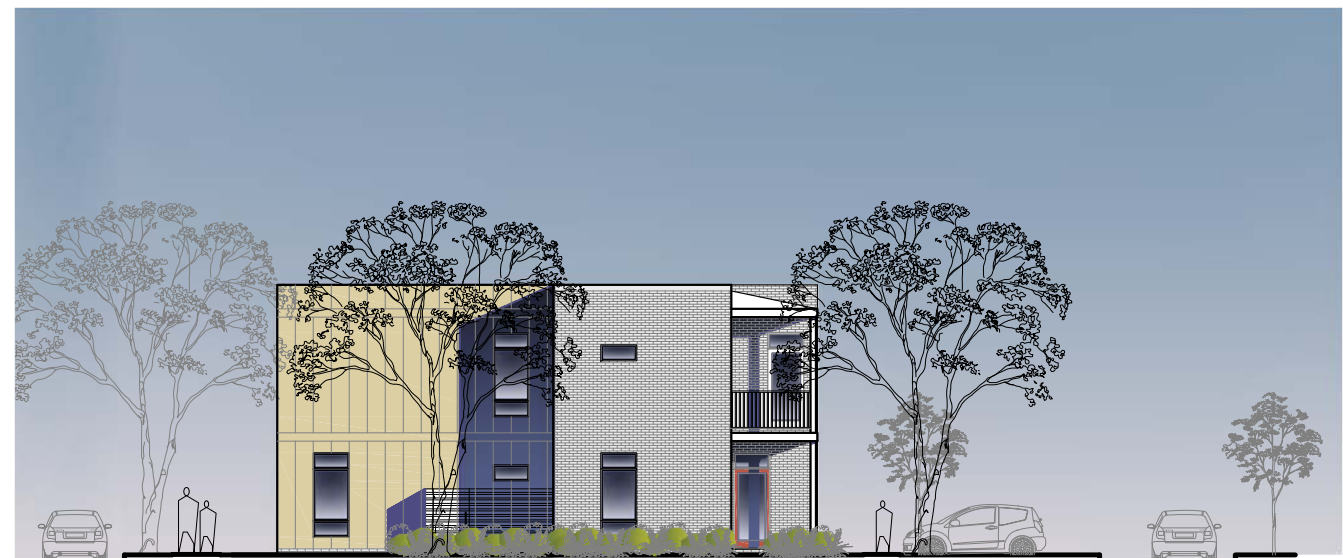
PEGRAM STREET ELEVATION