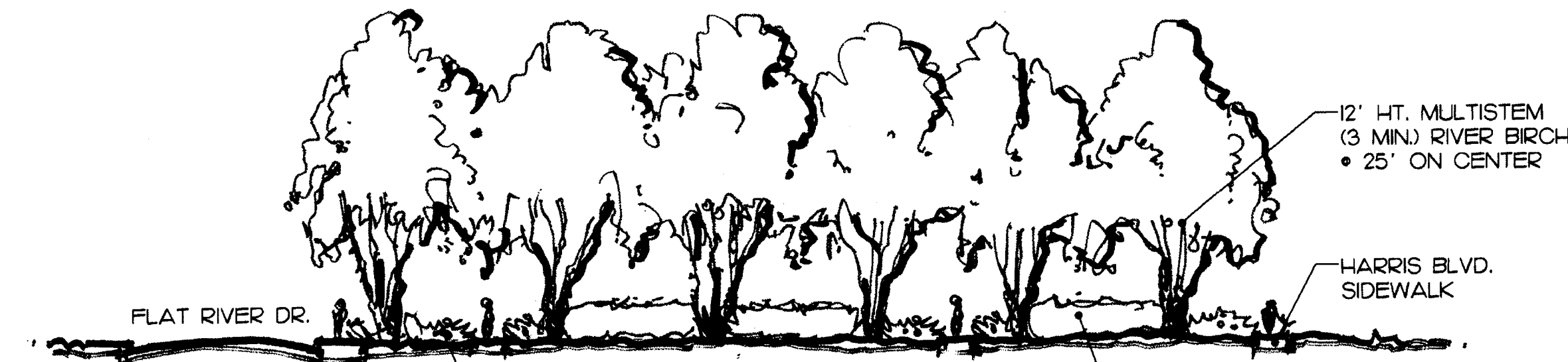
ELEVATION A. LANDSCAPE SCREEN SCALE: 1"=20'

Tax Parcel #: Portion of 047-131-85 & 047-131-55 Total SPA Area: 0.54 Acres Existing Zoning: MUDD-O Proposed Zoning: MUDD-O (SPA) Proposed use: Retail Allowed Square Footage: 8,600 Gross Square Feet Setbacks: 50' Building and Parking Setback (W.T. Harris Boulevard) 0' Side Yard Setback