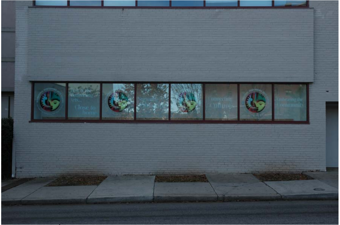
Spirit Square 7 th St. elevation