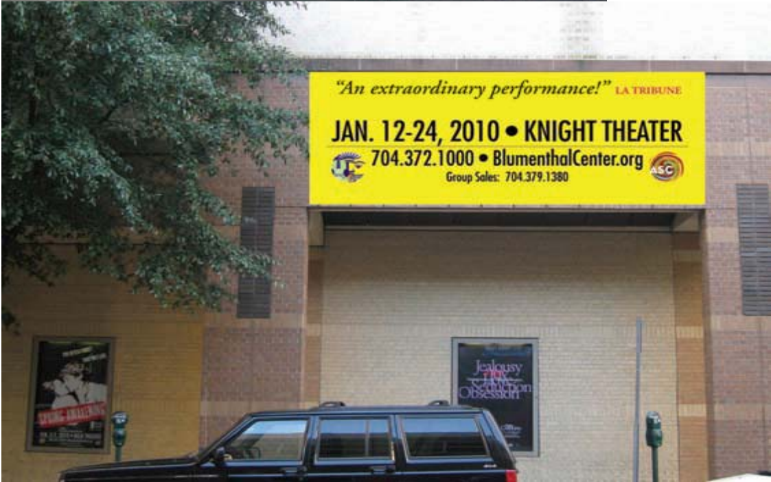
Example of banner