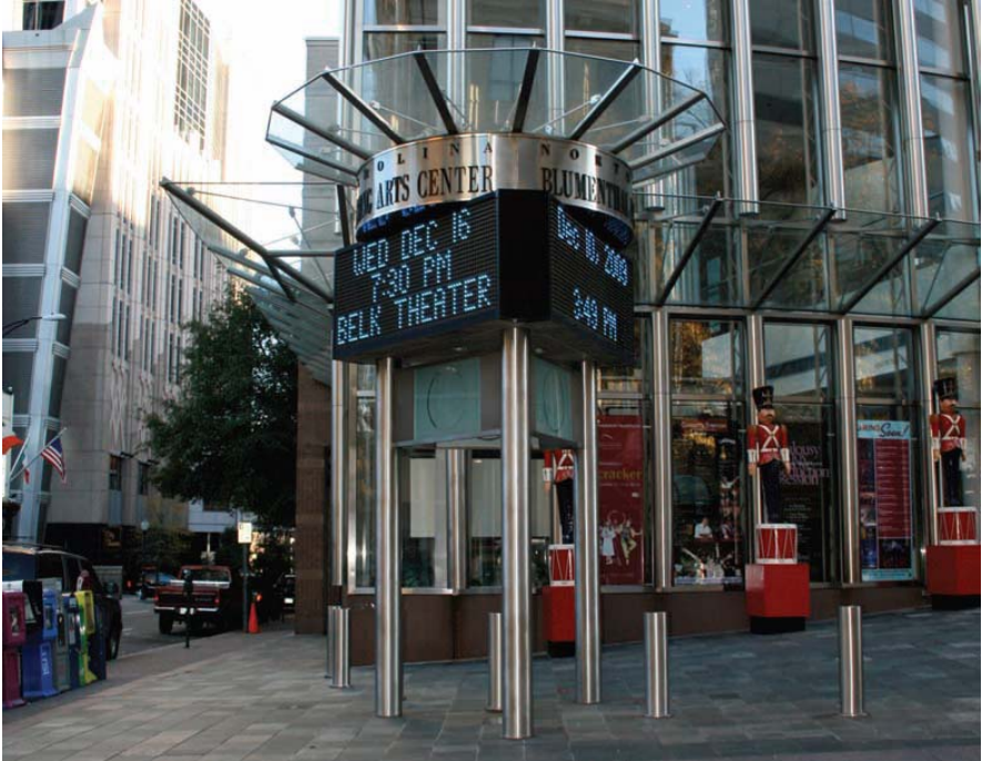
Example of LED screen