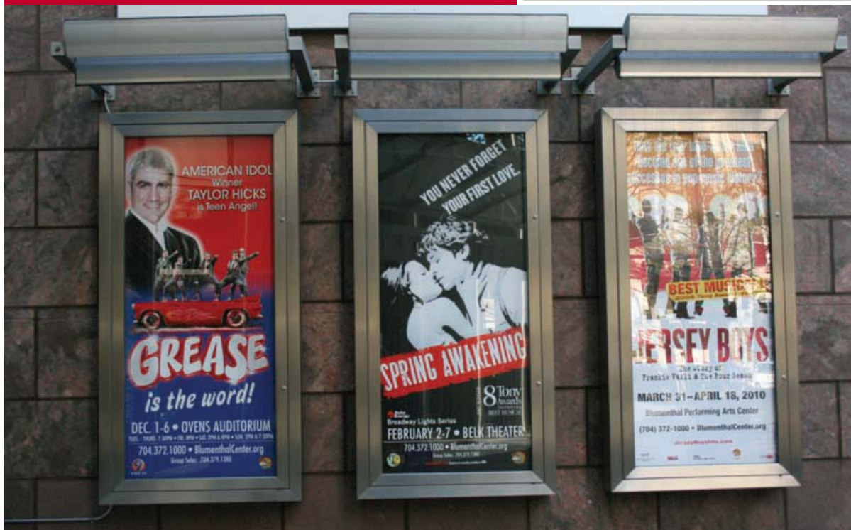
Example of bulletin boards