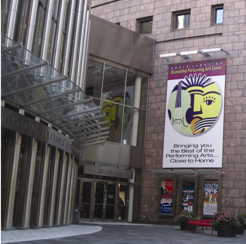
Example of Wall Signs