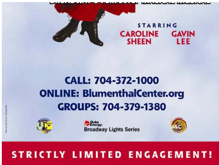
Example of advertisement on signage