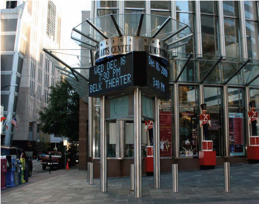
Example of LED screen