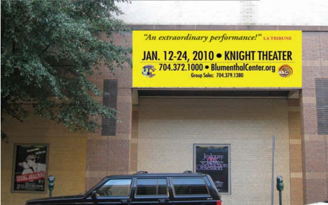
Example of banner