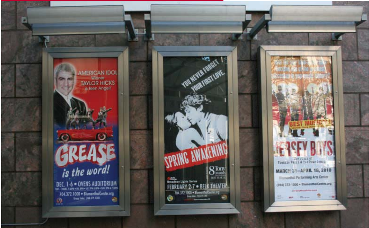
Attachment 2010-014B, existing bulletin boards located on Tryon St. facade