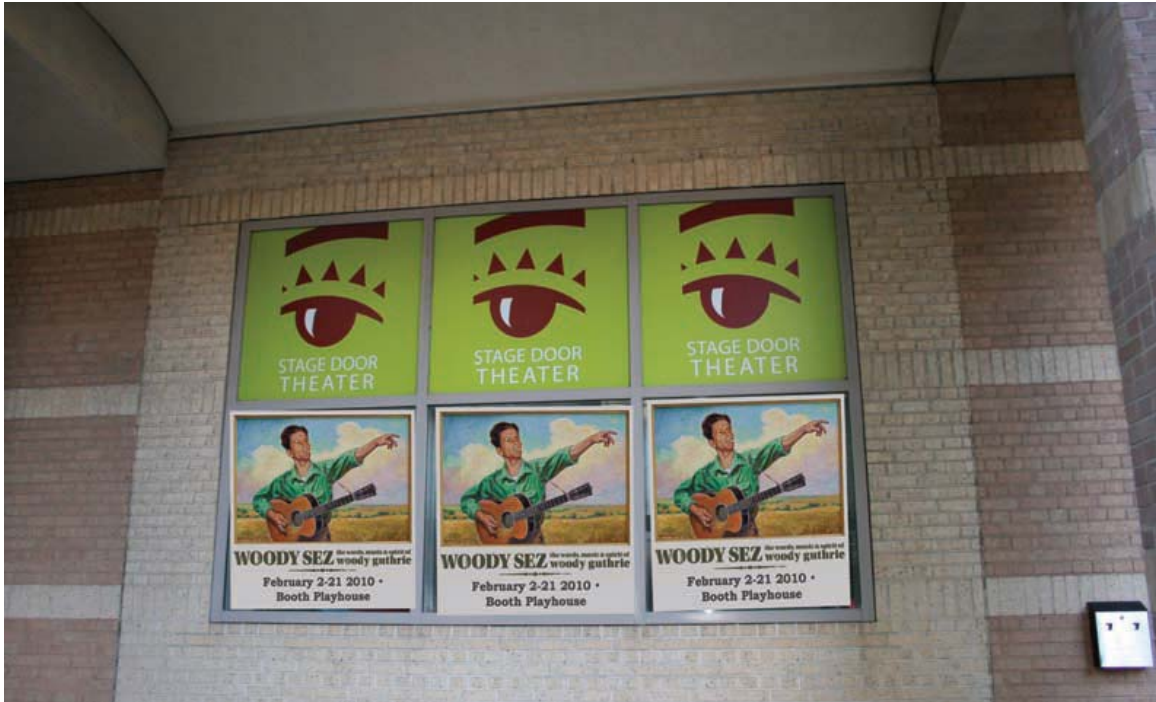
Attachment 2010-014A1, NCBPAC College St. elevation