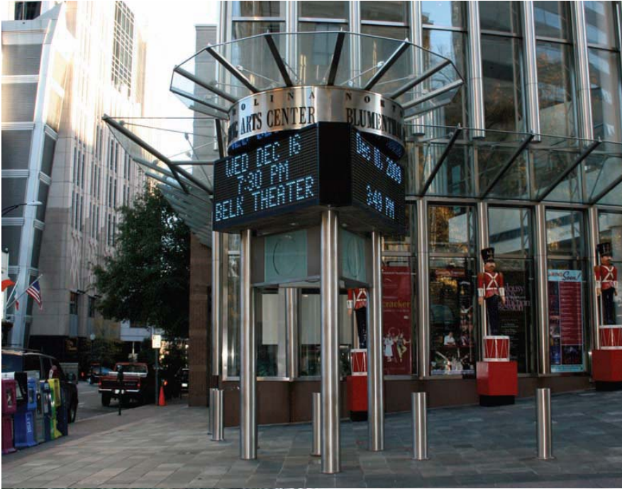
Example of LED screen