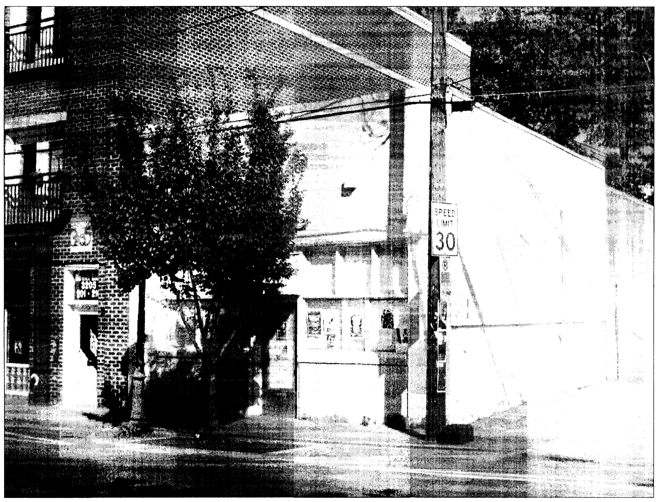
EXISTING BUILDING ELEVATION N.T.S.