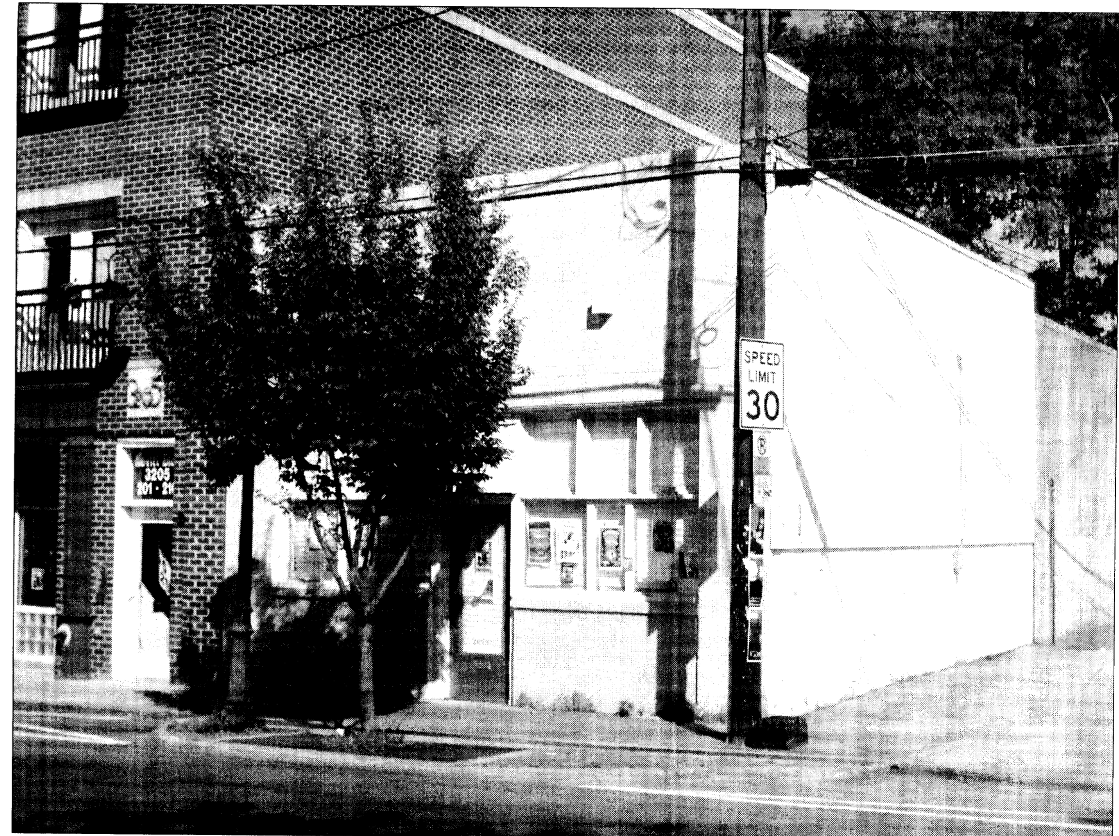
EXISTING BUILDING ELEVATION N.T.S.