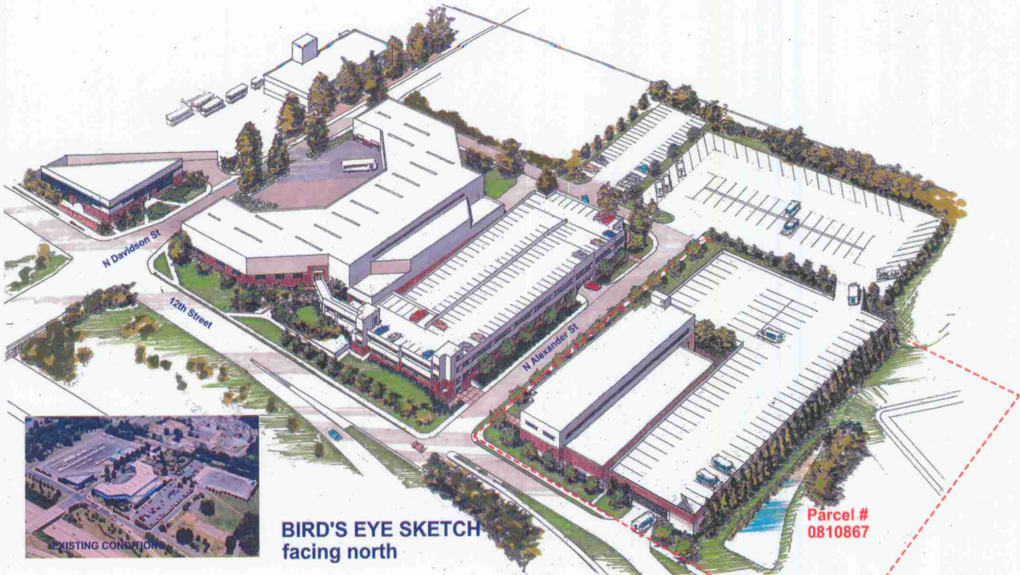
BIRD'S EYE SKETCH facing north