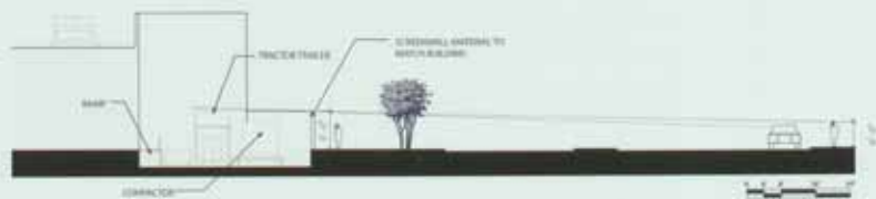
FRESH MARKET - CARMEL COMMONS SECTION VIEW 2/15/08