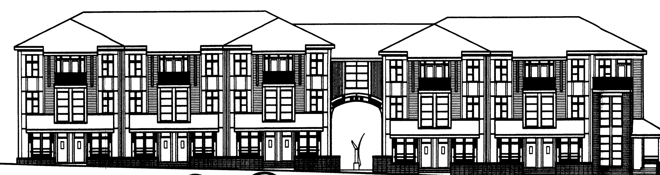
2 ELEVATION FROM TREMONT SLO 1/8" = 1'-0"

GENERAL EXTERIOR BUILDING MATERIALS: SMOOTH LAPPED AND VERTICAL SIDING WITH WOOD TRIM/HARDY ACCENTS OVERSIZED/UTILITY MASONRY BASE MATERIAL METAL/VINYL WINDOWS POURED CONCRETE STEPS, STOOPS & WALKS ASPHALT ROOF SHINGLES