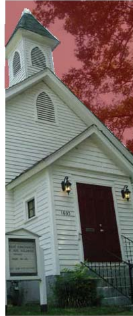
Cherry area plan