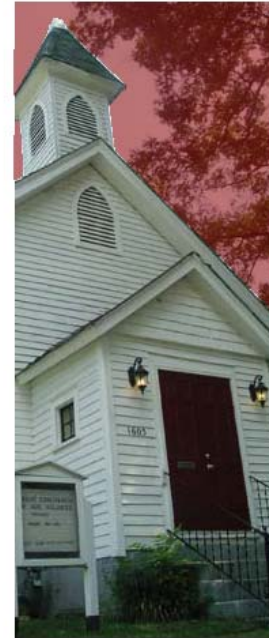
Cherry area plan