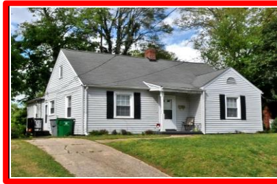
1944 Woodcrest Ave