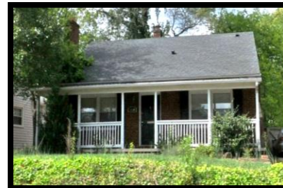
1940 Woodcrest Ave