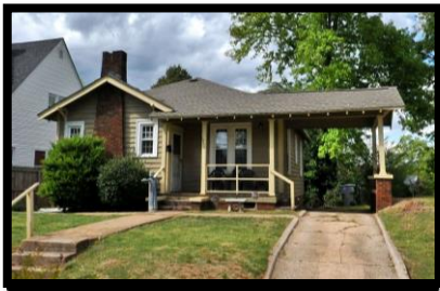
1950 Woodcrest Ave