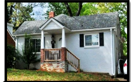
1936 Woodcrest Ave