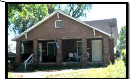
1937 Woodcrest Ave