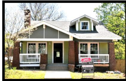
1949 Woodcrest Ave