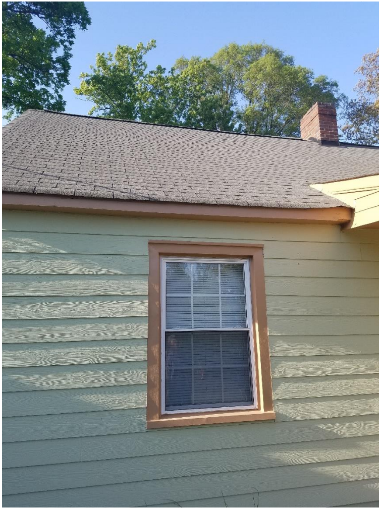
DETAILS — CIRCA 2018