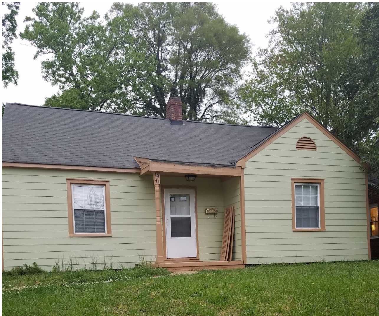
FRONT ELEVATION — CIRCA 2018