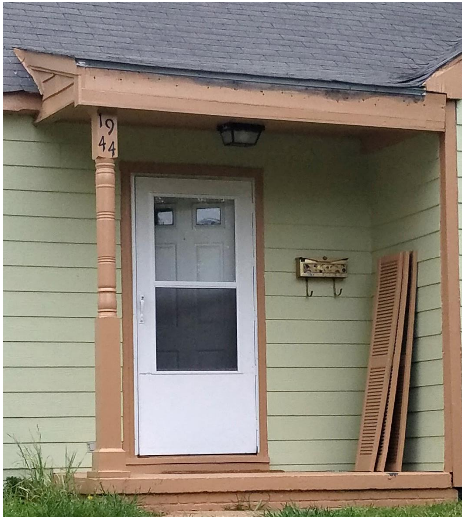
DETAILS — CIRCA 2018