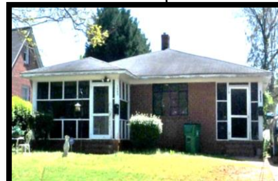
1945 Woodcrest Ave