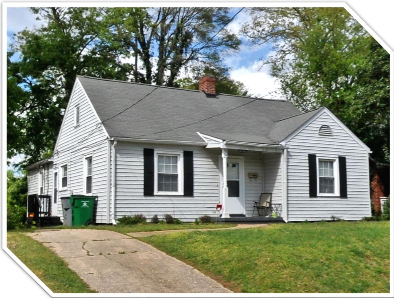
1944 WOODCREST AVE - WILMORE CASE No. HDC 2018-00492