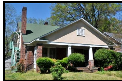
1720 Wilmore Drive