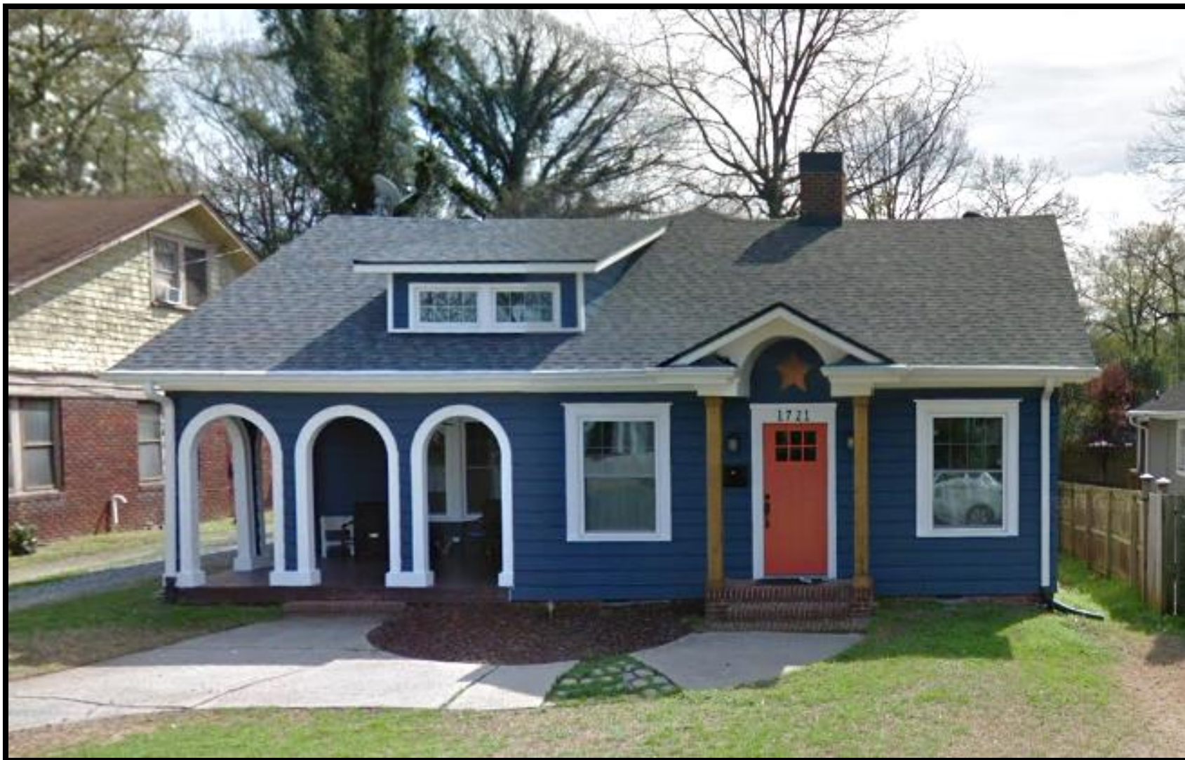
FRONT — CIRCA 2018