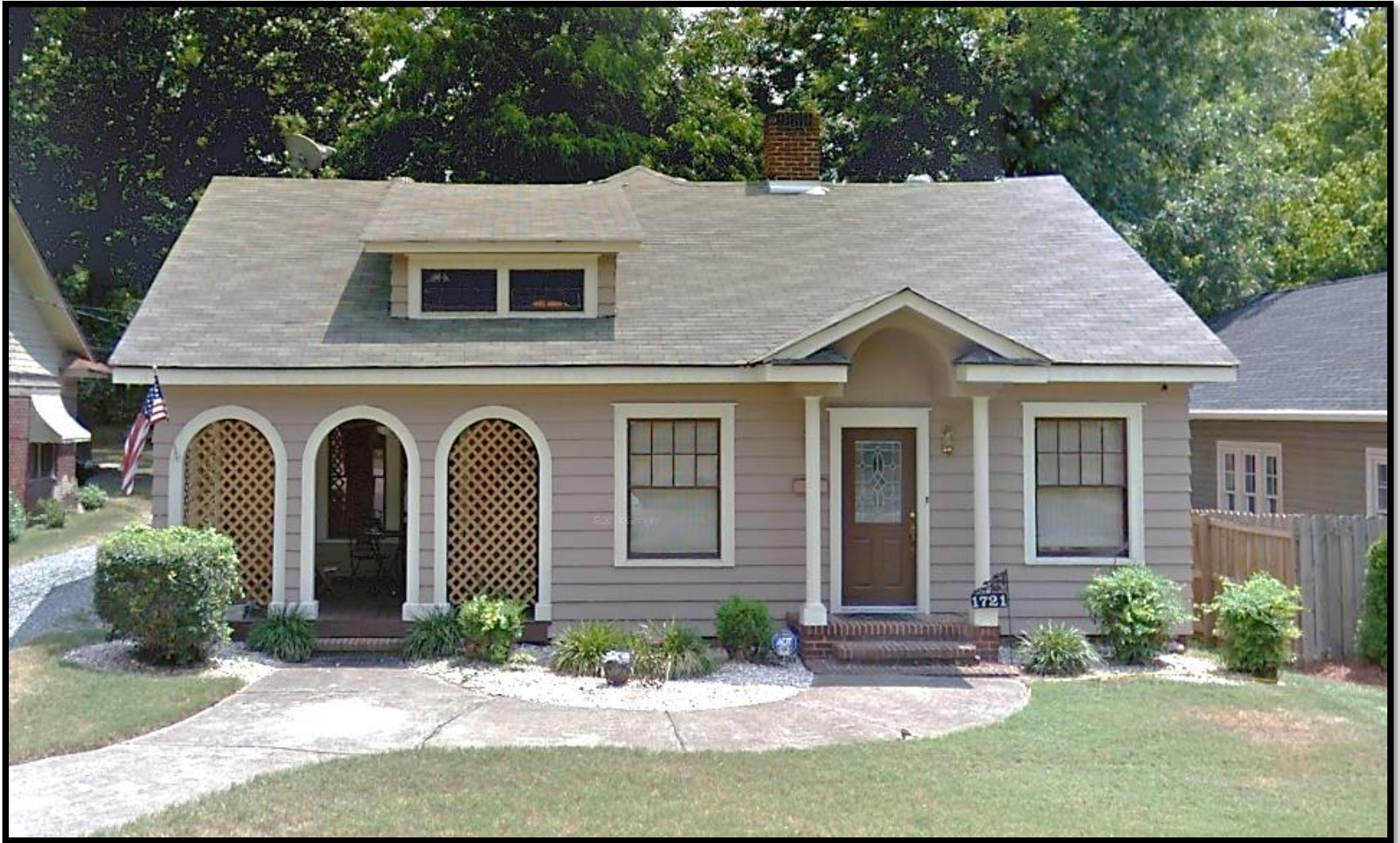
FRONT — CIRCA 2014