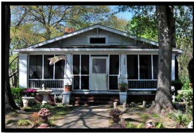
1728 Wilmore Drive