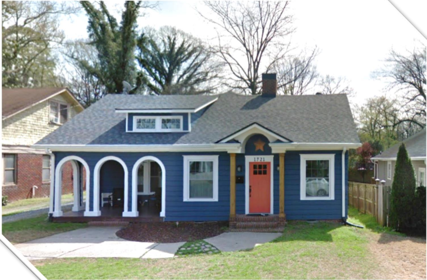
1721 WILMORE DRIVE - WILMORE CASE No. HDCRMI-2018-00485