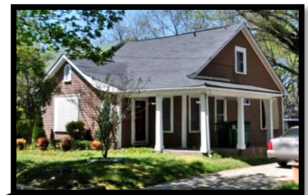
1716 Wilmore Drive