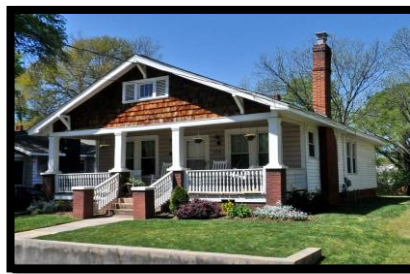
1724 Wilmore Drive