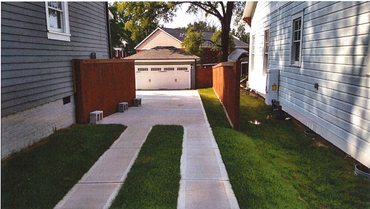
Side of property where section of proposed new fence will connect house and neighbor's existing fence.