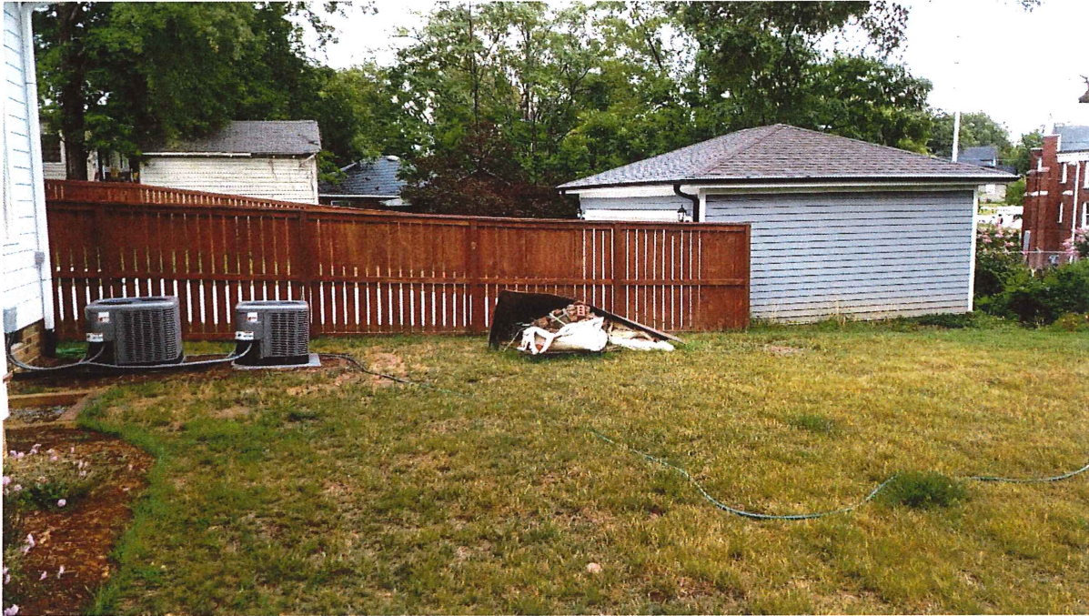
Left side of property with existing fence.