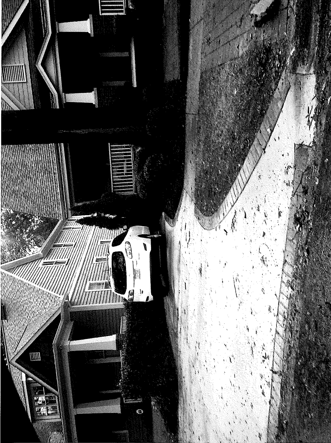
1919 Lyndhurst- Photo taken 9/27/2015. No COA.