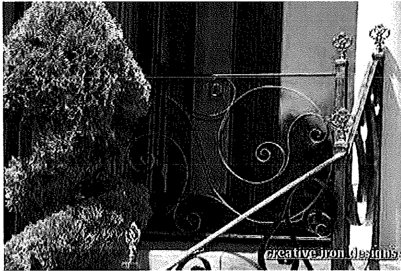
Proposed metal hand rail.